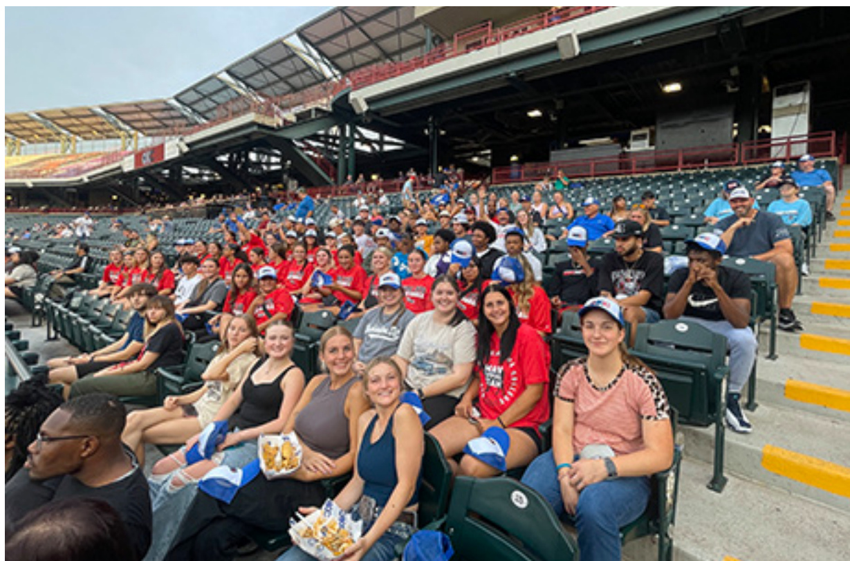
NOC Tonkawa and NOC Enid students attended the OKC Dodgers game on Tuesday night.