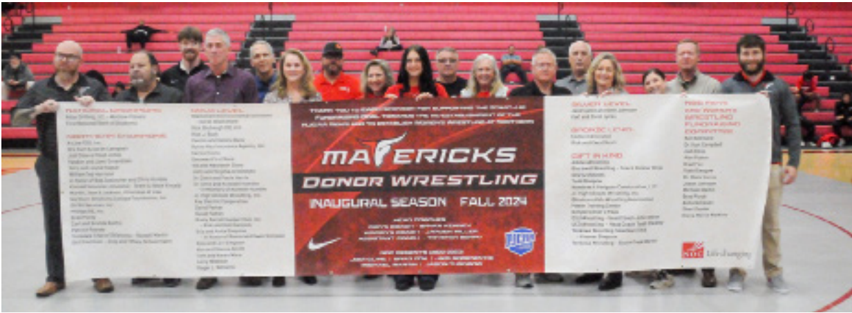
Wrestling donors and committee members were recognized at the NOC-Carl Albert dual last Saturday. The committee and donors helped re-establish the men's program and start the women's program.