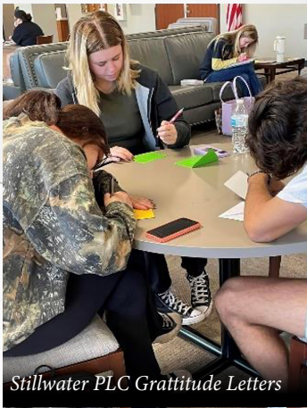
Stillwater PLC Gratitude Letters