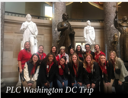
PLC Washington DC Trip

"The PLC trip to Washington D.C. was one of my favorite experiences of freshman year. I was able to see and learn so much about our government, the history of our country, and how we got to where we are today from the leaders who founded America. The trip was also essential in building connections with my peers and our sponsors, and consequently helped me build some of my most favored relationships since I got to Northern Oklahoma College. I believe that being able to continue these types of trips would be beneficial in making our PLC a stronger team and teach us how to be better leaders on campus and throughout our daily lives."