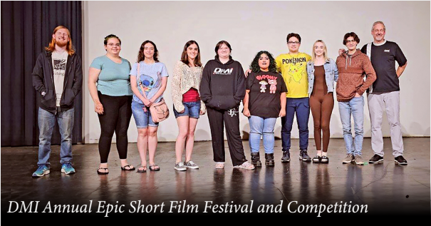
DMI Annual Epic Short Film Festival and Competition