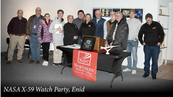
NASA X-59 Watch Party, Enid