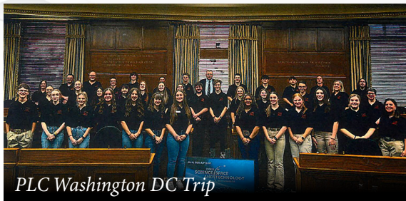
PLC Washington DC Trip