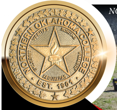
NOC Rocket Team Competition