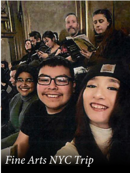
Fine Arts NYC Trip