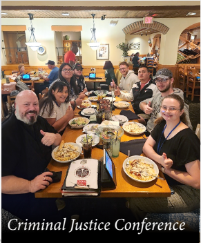
Criminal Justice Conference