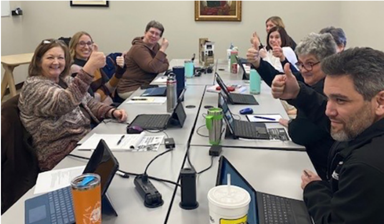
NOC Division Chairs getting ramped up for the 2025 Spring Semester.