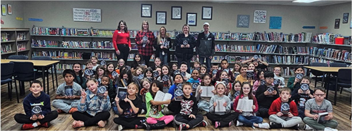
The Ponca City Rotary Club and Northern Oklahoma College presented dictionaries to every TES 3rd grade student on Dec. 12.