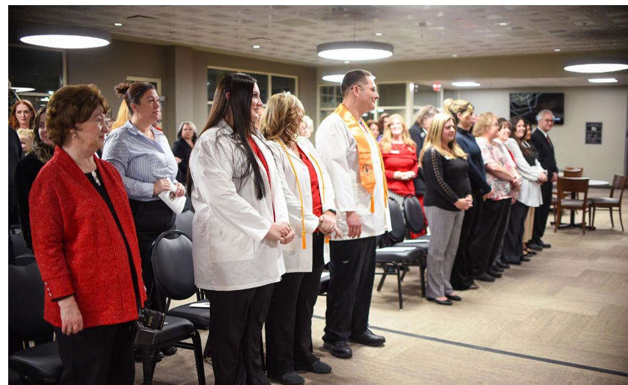
NOC Nursing graduates and faculty at the NOC Nurses Pinning Ceremony December 6 at NOC Stillwater.