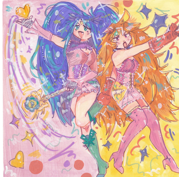
Macie Brophy, Art Major, Ponca City, OK "Vorp Gnarp (series of 4)" Acrylic on paper