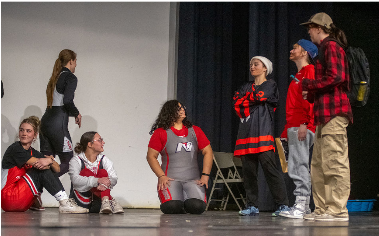
3rd Place -- Women's Wrestling