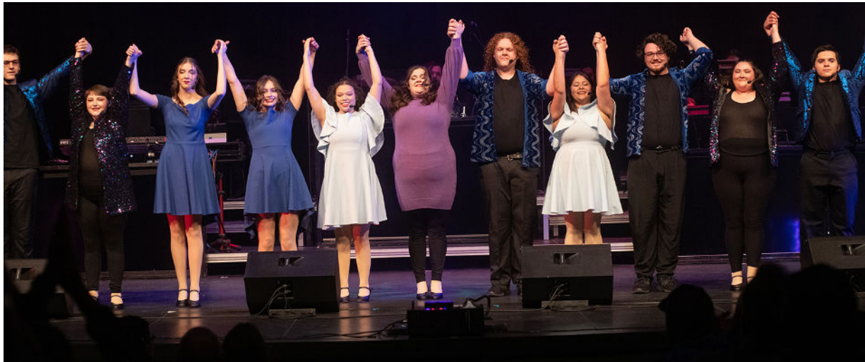
NOC Fine Arts students take a bow after the Homecoming Show on Wednesday at the KPAC.