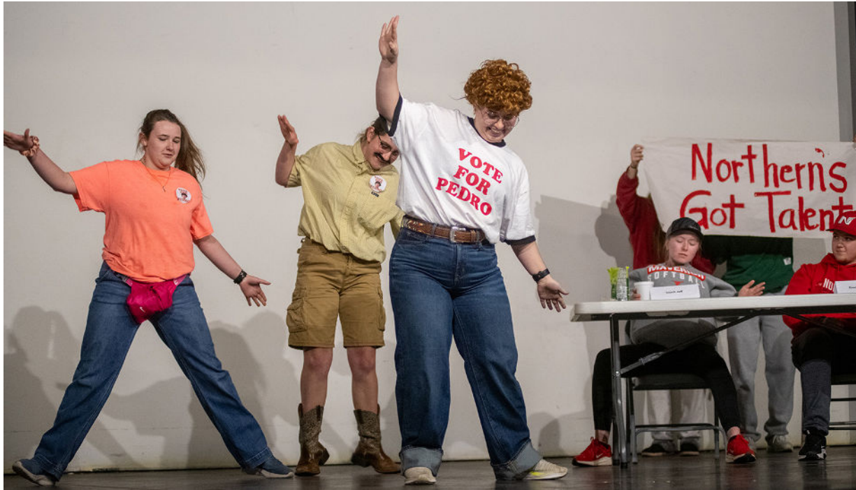
1st Place -- BCM