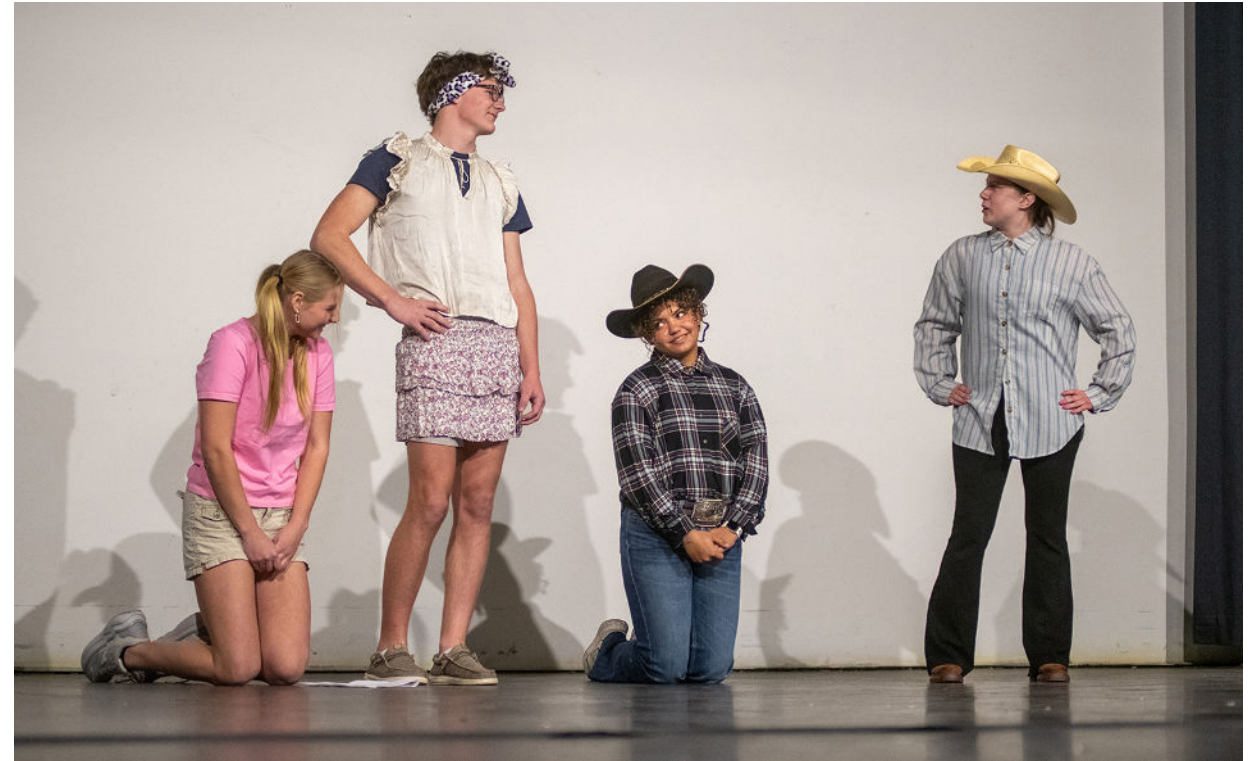
2nd Place - President's Leadership Council