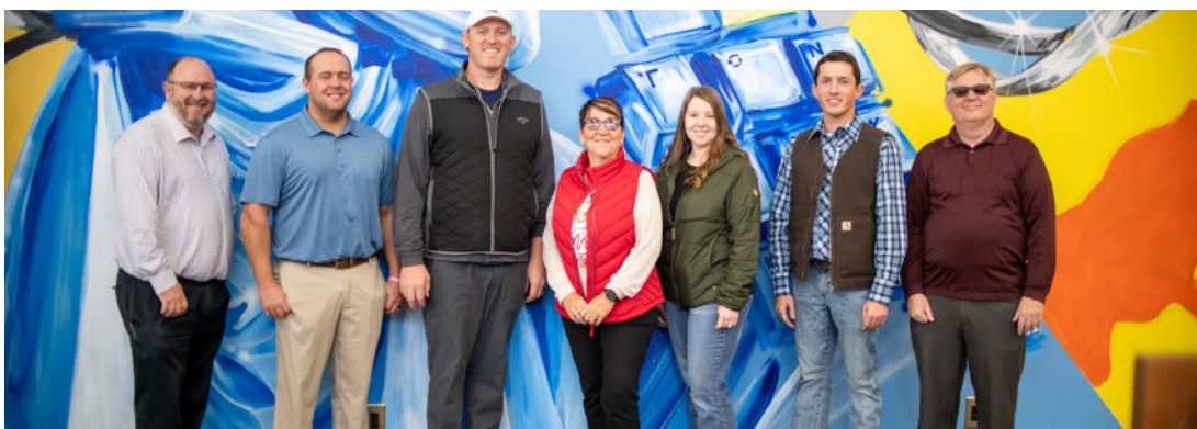
2025 TONKAWA LEADERSHIP CLASS

Several community groups joined us on our campuses earlier in the year to learn about our various programs at Northern Oklahoma College.