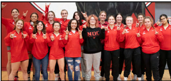
New Program Scholarship Fund through NOCF Resources Agreement to Support Development Activities 2 grants awarded totaling $10,000 for Men's and Women's Wrestling Program for 2024-2025 academic year