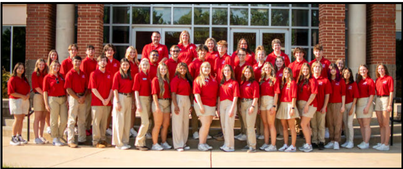
Presidential Partners Grant 16 grants awarded totaling $15,403.80 for the 2023-2024 academic year

Masonic Fraternity of Oklahoma Endowment Grant 6 grants awarded totaling $5,474 for the 2023-2024 academic year