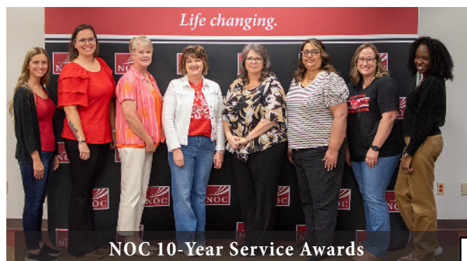
NOC 10-Year Service Awards