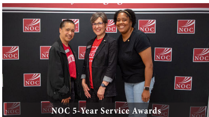
NOC 5-Year Service Awards