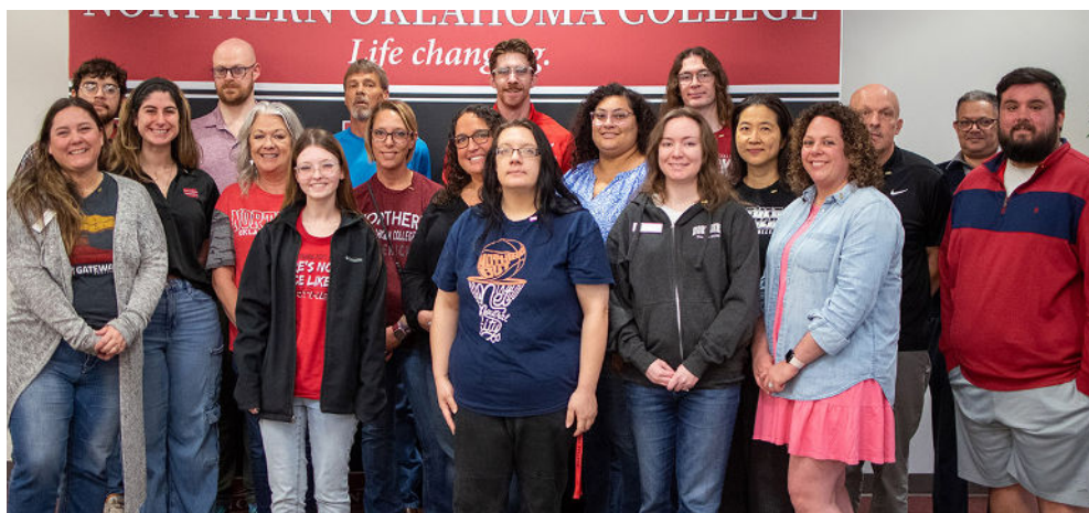
NOC 1-Year Service Awards

Northern Oklahoma College faculty and staff received service pins Friday, May 9, at the In-Service at the Renfro Center in Tonkawa. Outstanding Faculty, Professional Staff, and Support Staff were honored and six retirees were recognized.