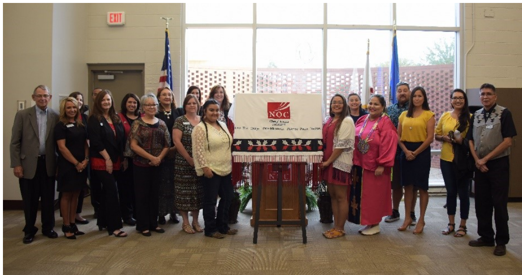
Photo Caption: Open House for the Cultural Engagement Center, Sept. 12, 2017