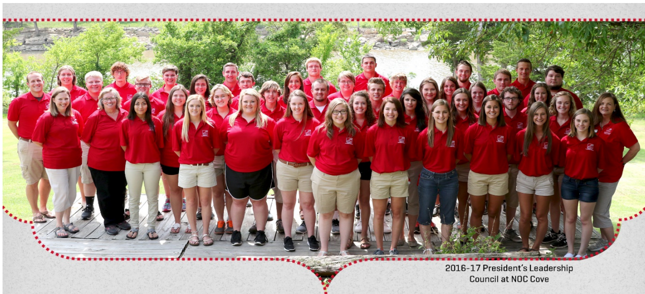
2016-17 President's Leadership Council at NOC Cove