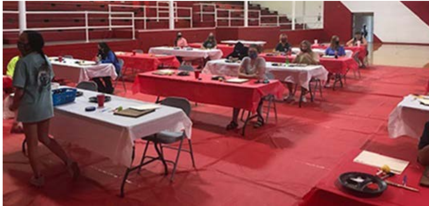
Forty NOC Tonkawa students attended a theme paint night at the east gym Monday night.