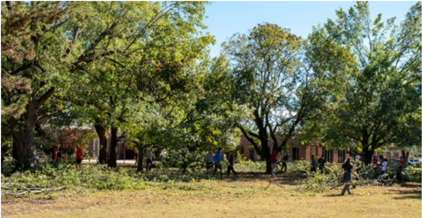
NOC Maverick baseball players clean up tree limbs after ice storm hits. NOC Tonkawa was without power for Tuesday and Wednesday. Classes were cancelled due to lack of power.