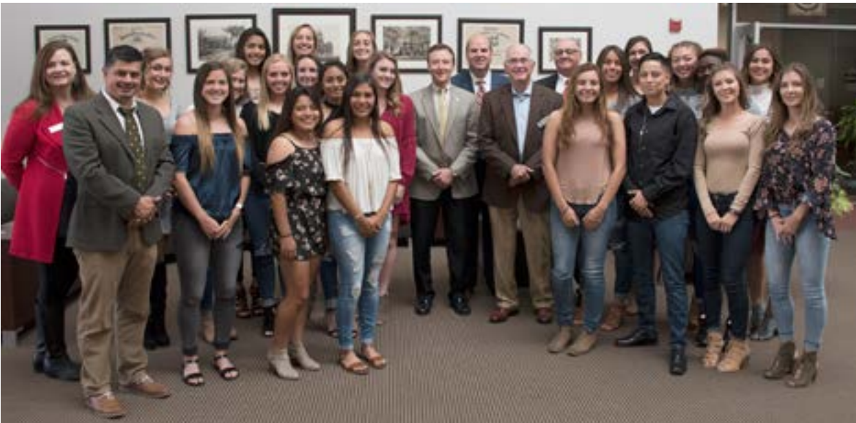
The Women's Soccer Team was recognized at the NOC Board of Regents Meeting Tuesday for an Academic Award received for 2016-17. The team had a cumulative 3.56 GPA while only 13 teams across the nation maintained a 3.00 GPA. The women's team is in the Region II Playoffs this weekend at NEO in Miami.