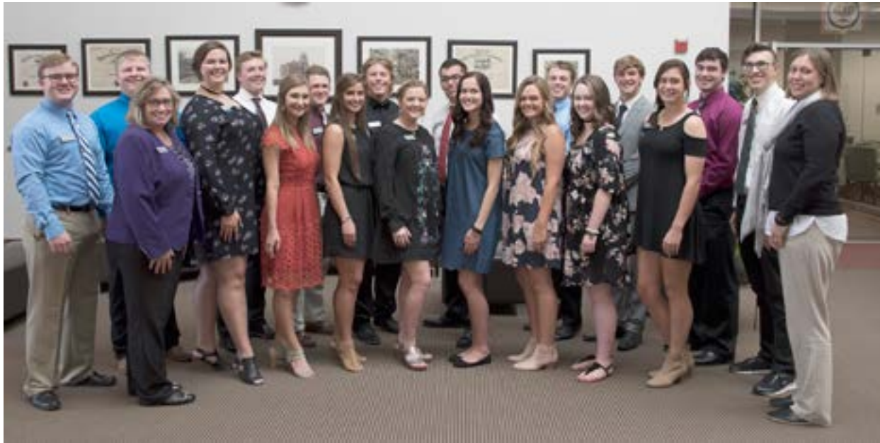
PLC Students at the NOC Tonkawa were recognized at the October NOC Board of Regents Meeting Tuesday at Tonkawa. The Regents viewed a slide show of the PLC's trip to Washington, D.C. over Fall Break.