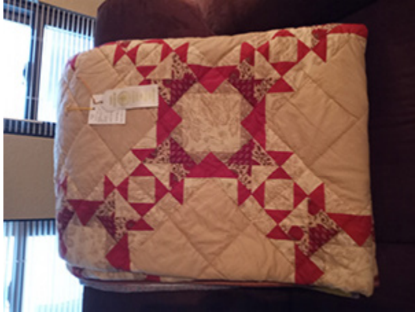
Third Place – Household Arts, M16 Quilts, large minimum 60” to maximum 110” wide and 0” or more long (Friendship Quilt Pattern). I constructed and quilted this quilt for my husband's and my 10th anniversary this year (July 17, 2011 - 2021).