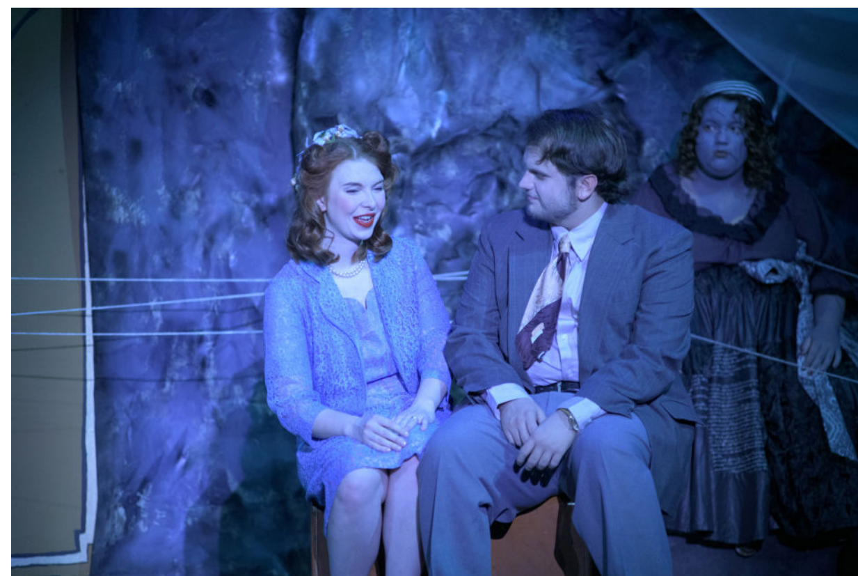
NOC Fine Arts presents 'Eurydice' through Sunday at the KPAC at NOC Tonkawa.

There is limited seating, social distancing and face masks are strongly encouraged.