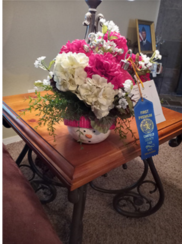
First Place – Arrangements – Artificial, P117 Exhibitors Choice (Snowman centerpiece for Christmas).