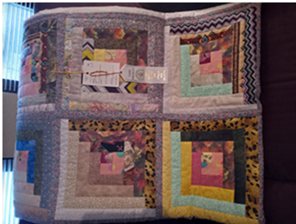
Third Place – Household Arts, M21 Quilt constructed and quilted by same person (Log Cabin Quilt Pattern). The pieces for this quilt are from my mother's quilt scraps, my sorority sister's quilt scraps, quilt scraps of my own.