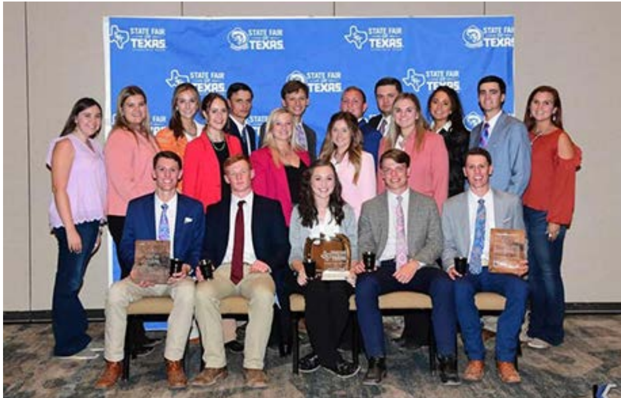
NOC Freshman Livestock Judging Team