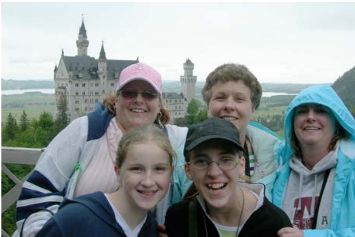
Travelers on a similar trip with NOC in 2006 stand in front of the legendary Neuschwanstein Castle in Bavaria, Germany.