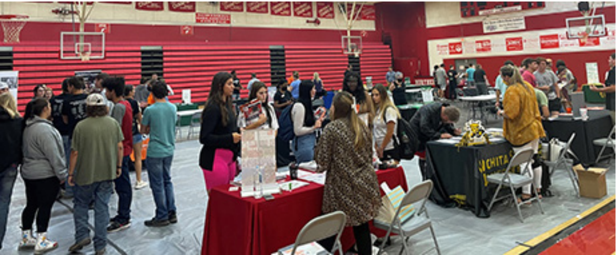
NOC Tonkawa hosted a College Fair Tuesday at Foster-Piper Fieldhouse. Over 200 area high school students attended the event

first 100 tailgaters. The tailgate has a 20x20 tent, Full DISH Media Package, and Large Screen TV. The event is hosted by the NOC Alumni and Friends Association and NOC Foundation. For more information, contact the Development Office at 580.628.6473.