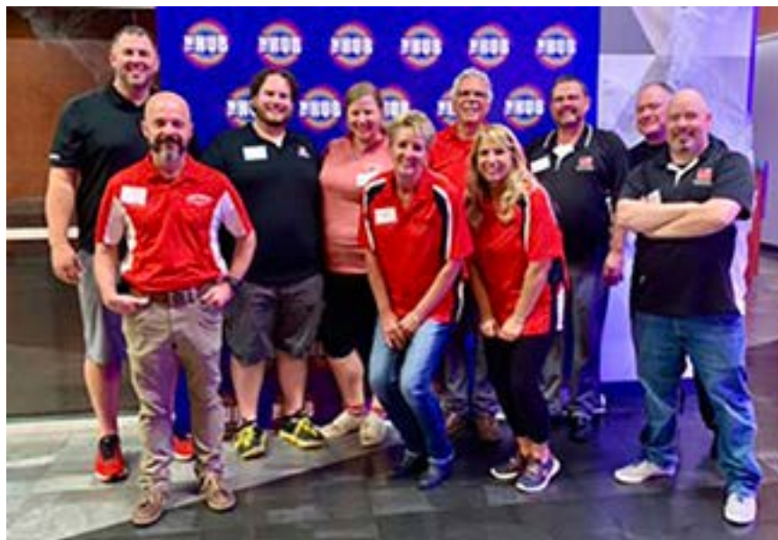
NOC faculty and staff participated in a Bowling Tournament Fund Raiser for the Tonkawa Development Authority last Tuesday night at The Hub in Tonkawa.