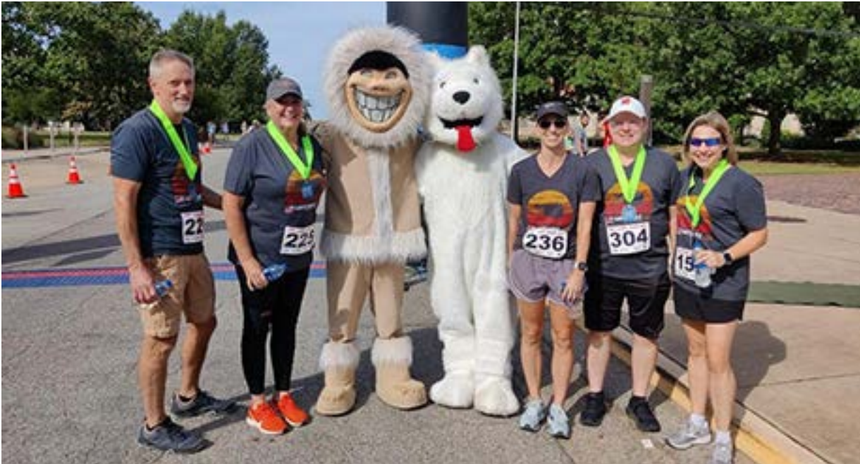
A group of NOC Stillwater faculty/staff walked the 5K in the Eskimo Joe's Juke Joint Jog, which is a fundraiser for the United Way of Payne County.