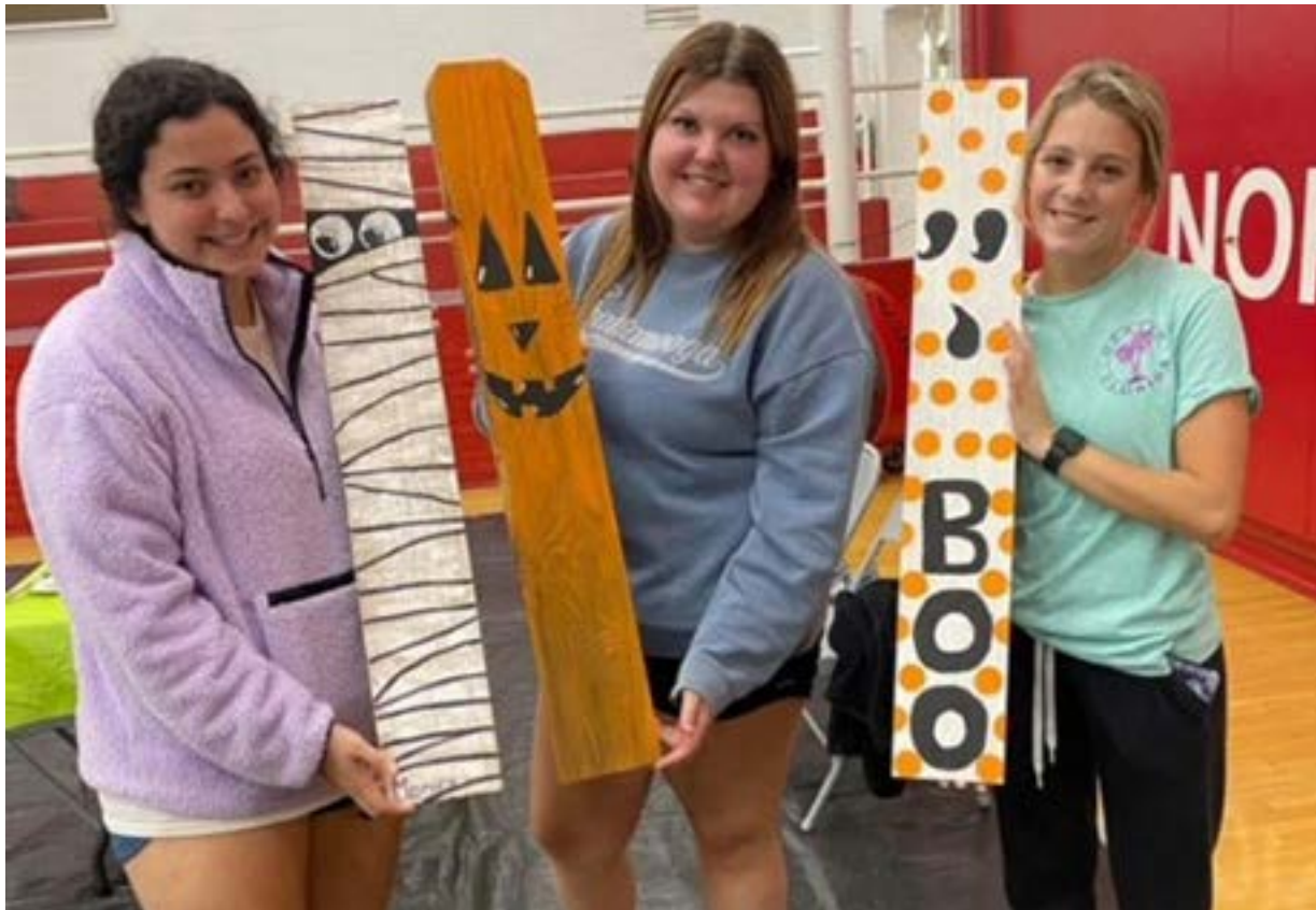
NOC Tonkawa Students participated in Paint Night, sponsored by Resident Life.