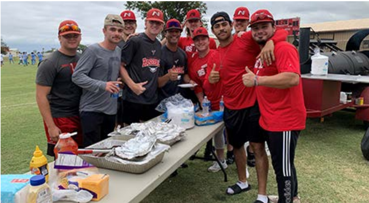
Mavs Baseball attended a Maverick Magic Club Cookout Thursday for NOC students at the NOC Soccer Field.