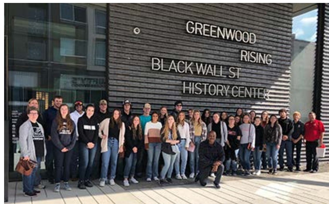
The Presidents Leadership Council visited the Greenwood Rising Memorial in Tul-