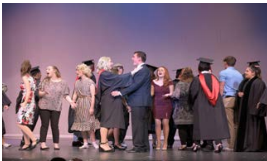
The cast of Legally Blonde sing cheerfully in the last scene of the show, "Find My Way."