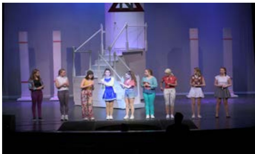
The Delta Nu sisters sing in opening number of "Omigod You Guys" in Legally Blonde.