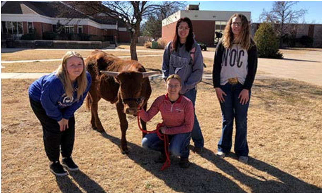
“Mav” celebrated his 1st Birthday on Monday with a birthday cake. Students had a chance to meet the NOC Tonkawa mascot near the clocktower.