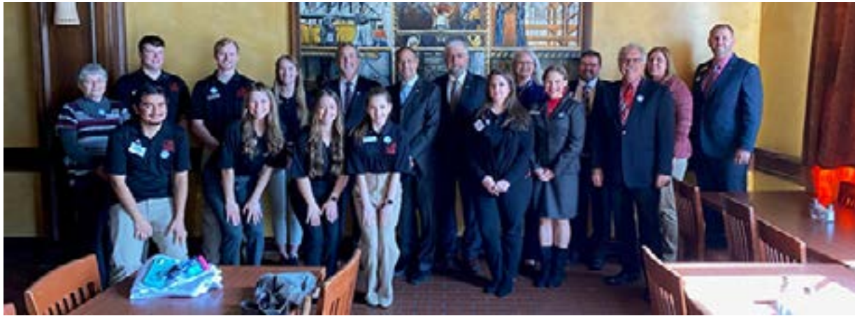
NOC faculty, staff, and students attended OSRHE Higher Education Day on Tuesday (photo provided)