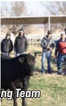
With Northern's Award-Winning Livestock Judging Team