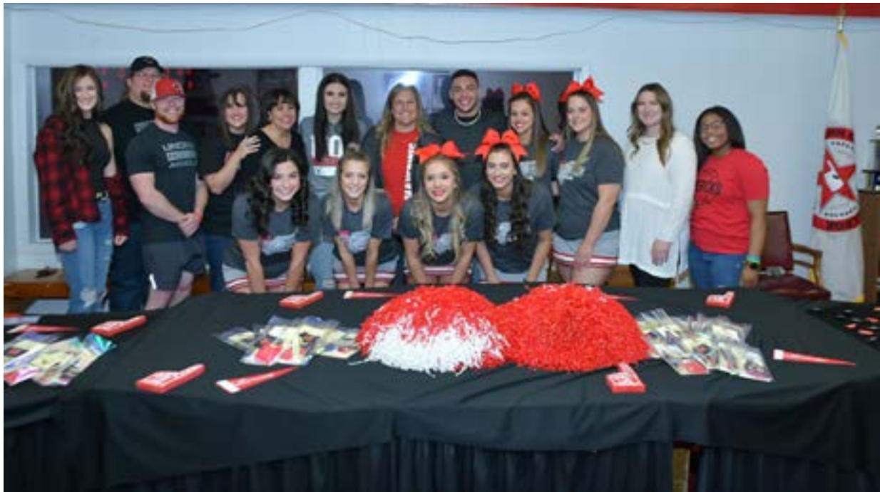
The NOC Maverick Cheerleaders held a cheer reunion Monday night at the Harrison Room in Foster-Piper Fieldhouse.