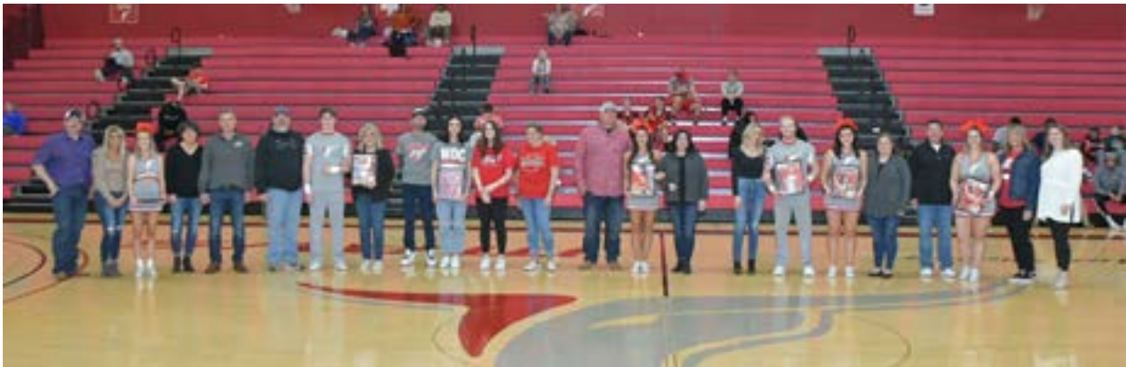
NOC Tonkawa Cheer Sophomore and Parents