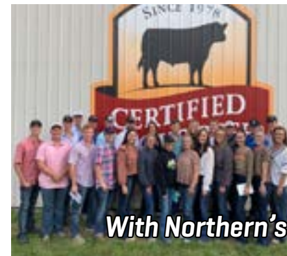
With Northern's Award-Winning Livestock Judging Team