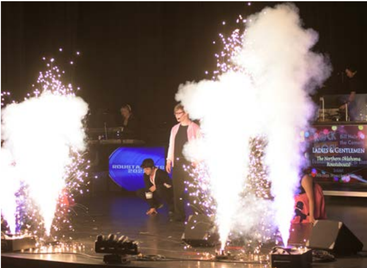
The Northern Oklahoma College Division of Fine Arts presents the Roustabout Benefit Show Saturday, April 2. Showtime is at the Kinzer Performing Arts Center at 7:30 p.m. Tickets are $10 for adults and $7 for students.

Northern Oklahoma College has one of the top nursing programs in Oklahoma, according to nursingschoolhub.com. NOC was ranked 7 th best nursing program in Oklahoma according to the 2022 list. NOC has two nursing degree tracks (AAS in Nursing (RN), AS pre-nursing (BSN transfer) One is for those who want to become an RN right after graduation. The other is for those who want to pursue a BSN after earning their degree. Among both types of students, many believe that Northern Oklahoma College as the best nursing school in Oklahoma. Both programs teach core nursing skills so that students can provide excellent patient care. Students also learn about the nursing industry as a whole. They learn from expert faculty members who understand today's nursing field. Finally, students move on to work in community and healthcare settings. The Top 10 list includes the following: 1. The University of Oklahoma. 2. Oklahoma State University-Oklahoma City. 3. University of Tulsa. 4. Oklahoma City University. 5. Oral Roberts University. 6. East Central University. 7. Northern Oklahoma College. 8. Oklahoma Baptist University. 9. Oklahoma Christian University. 10. Southwestern Oklahoma State University.