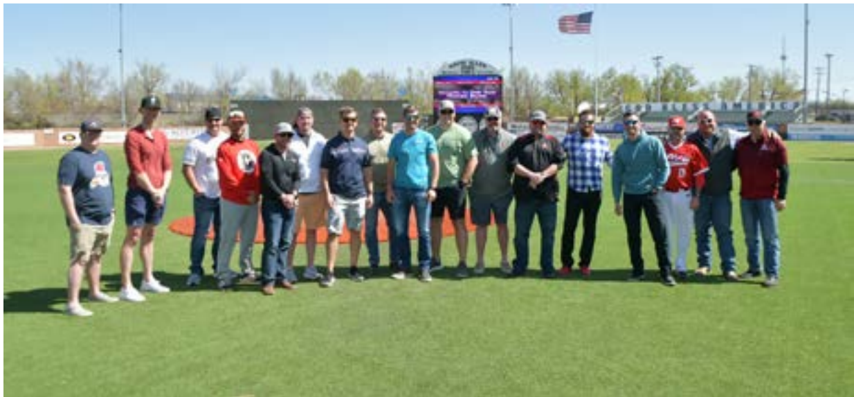
NOC Enid Baseball Alums were celebrated at a reunion last Saturday for the 20th anniversary of the Jets first NJCAA D2 World Series appearance in 2002.