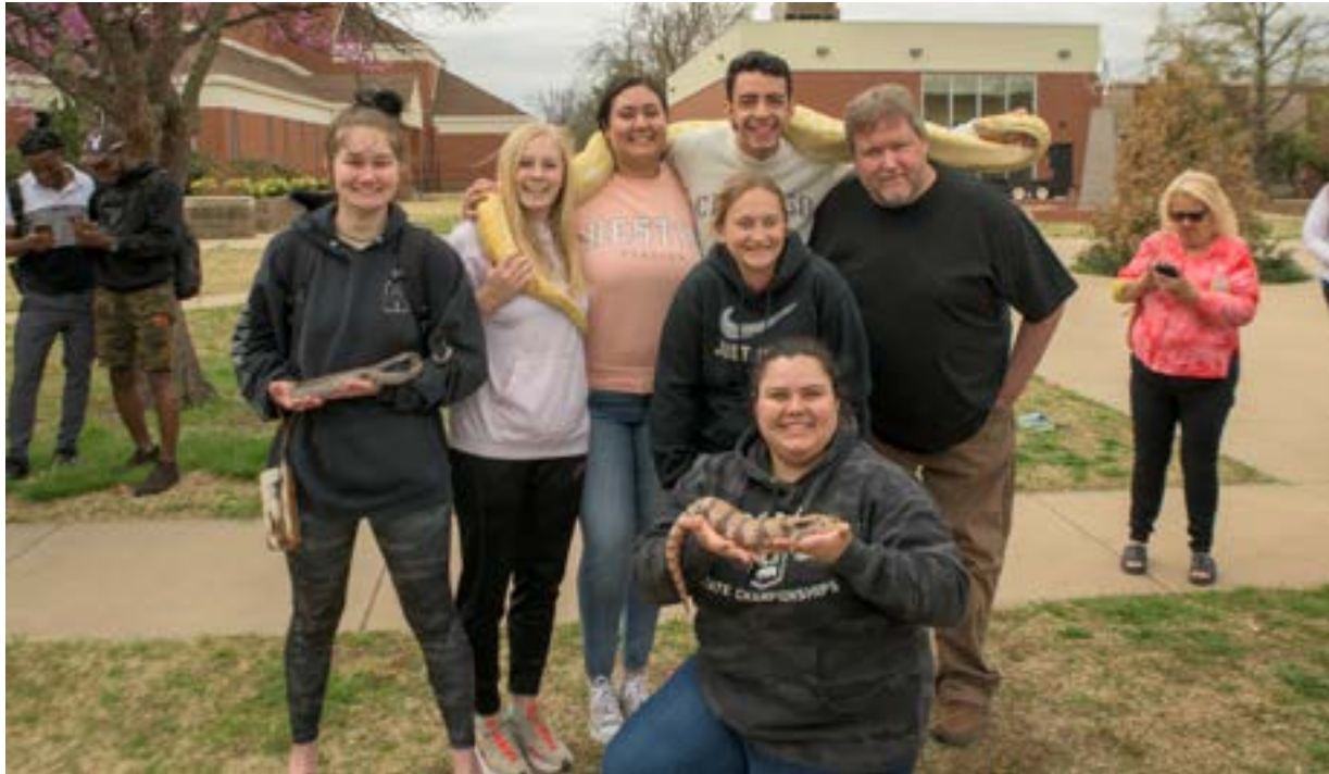
Exotic Animals Zoo