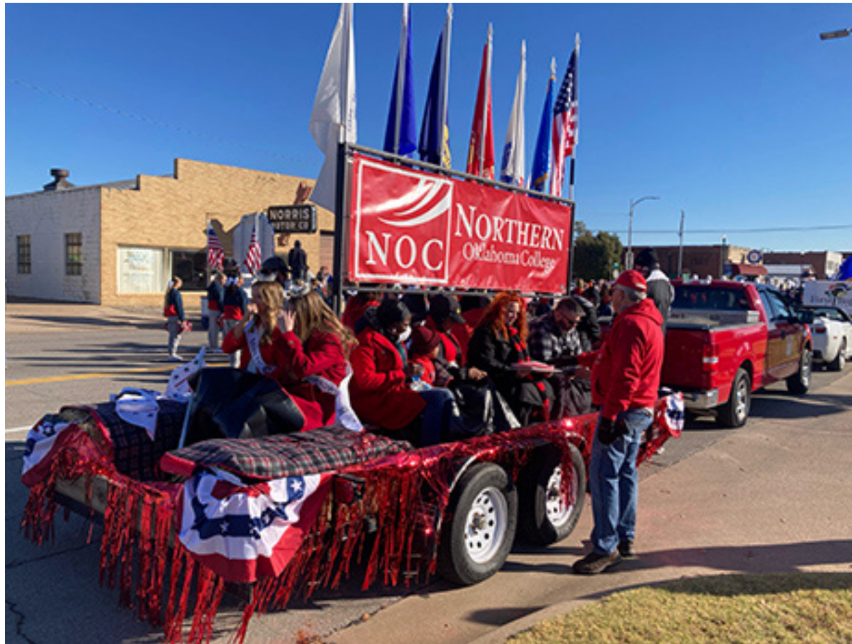
NOC participated in the Ponca City Veterans Day Parade Saturday, Nov. 5