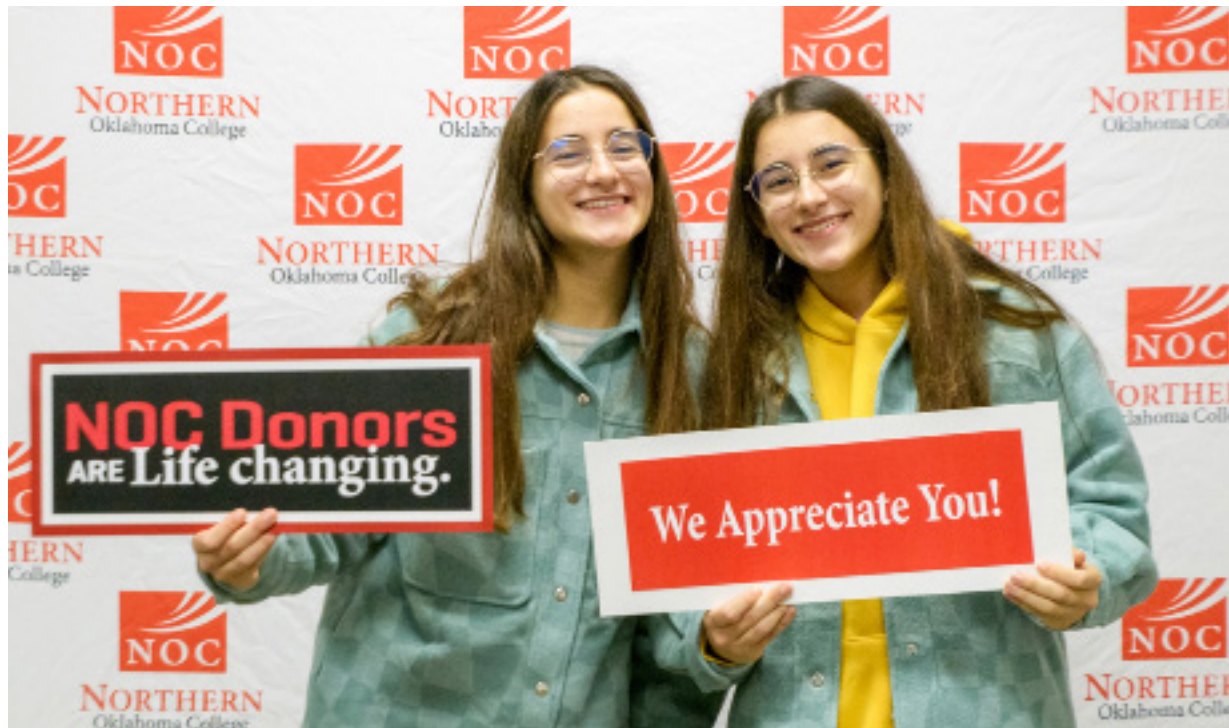
NOC Tonkawa students had an opportunity thank donors for their scholarships at a Thank-A-Thon event Thursday night.