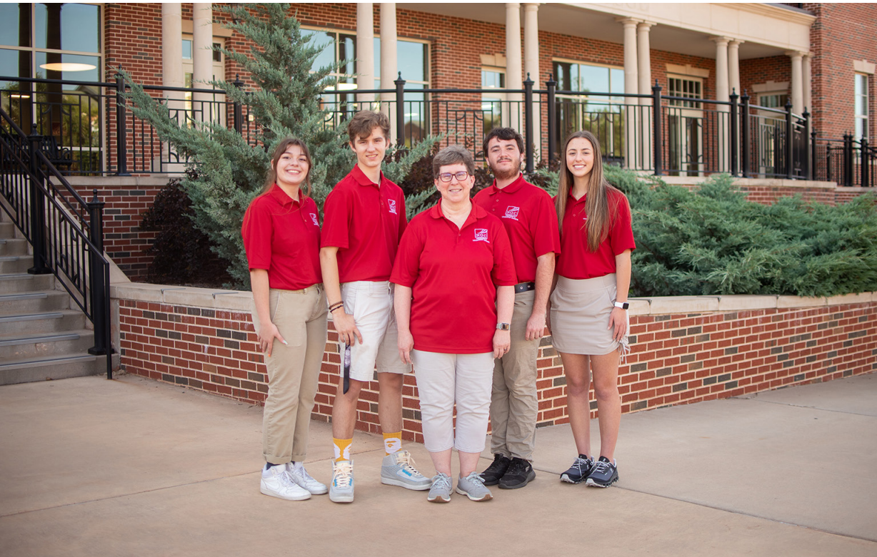
NOC Stillwater PLC