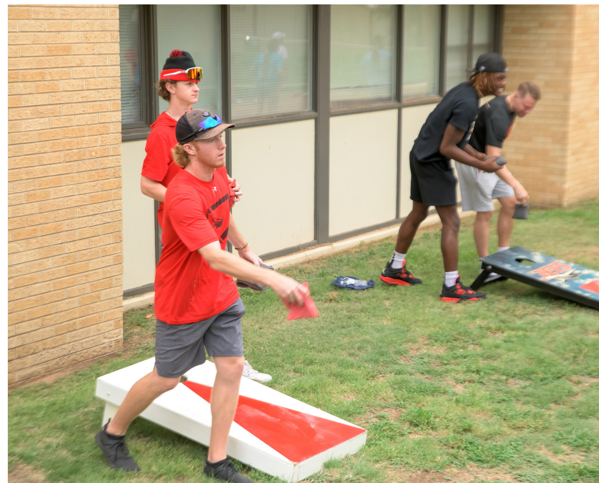
NOC Enid Students play cornhole in 2022 as part of Move-In Week. Students will return to campus this coming week for the Fall 2023 semester.

Block Party (Cookout/Yard Games/Music), College Circle, 6:30 p.m.