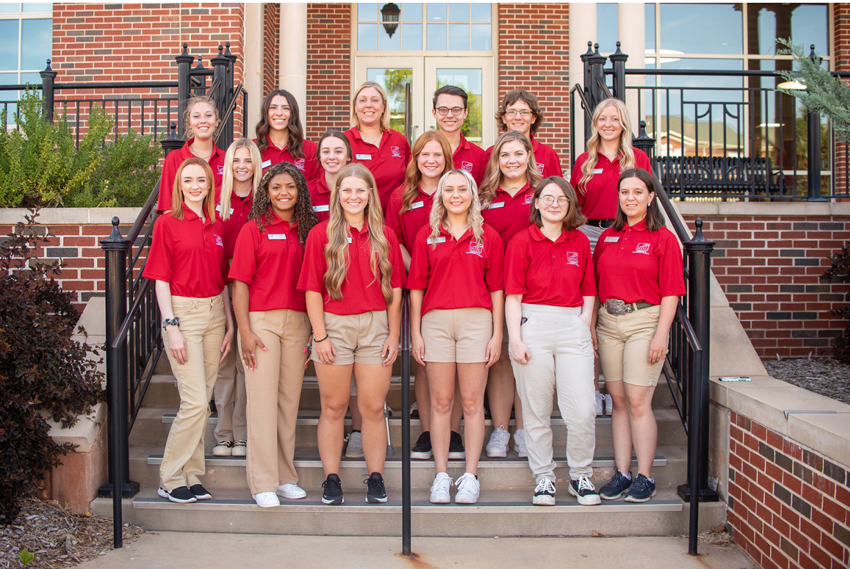
NOC Tonkawa PLC