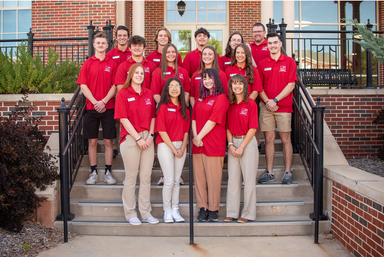
NOC Enid PLC