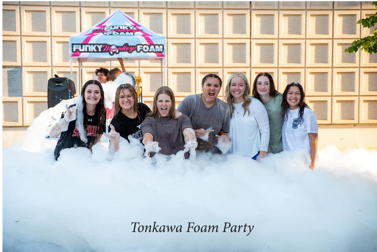
Tonkawa Foam Party