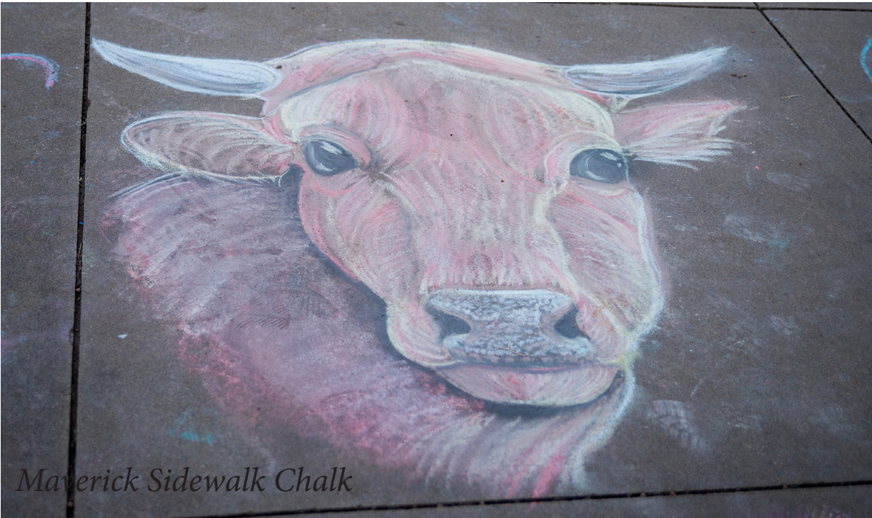
Maverick Sidewalk Chalk