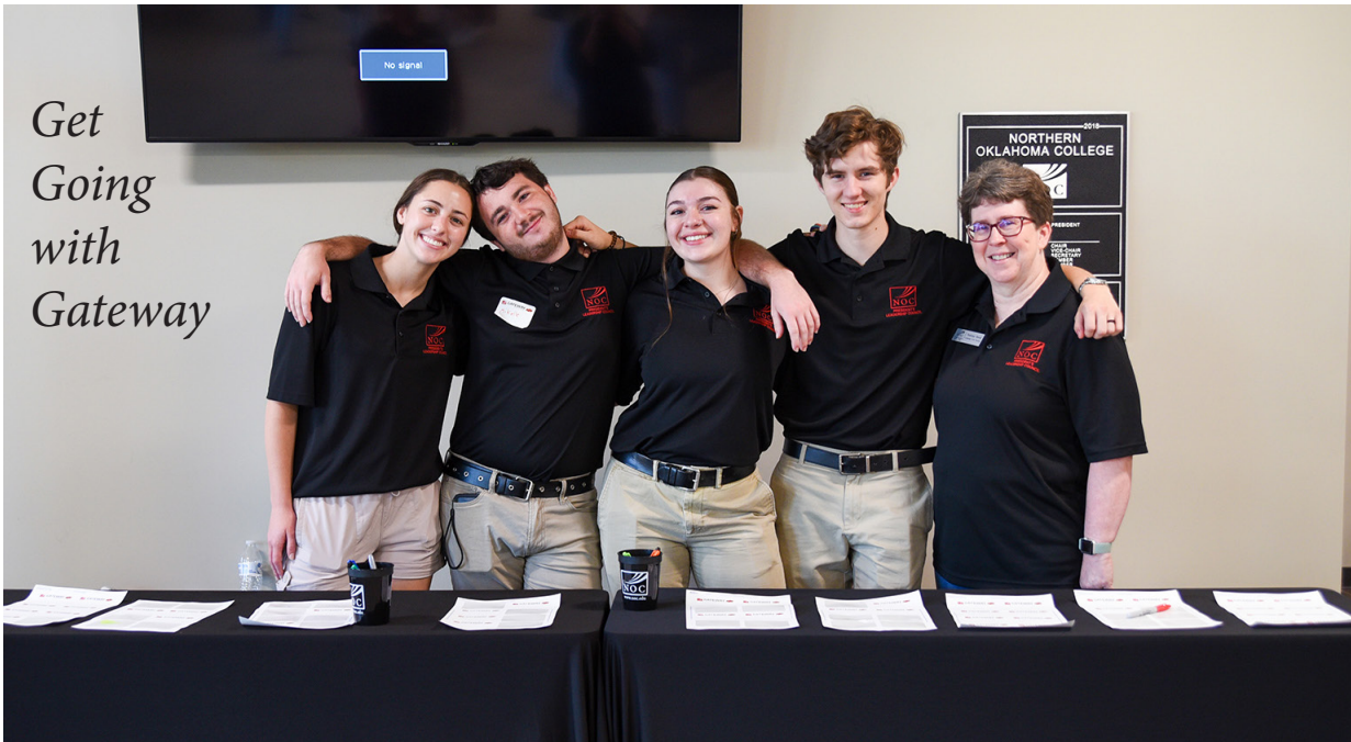
Get Going with Gateway