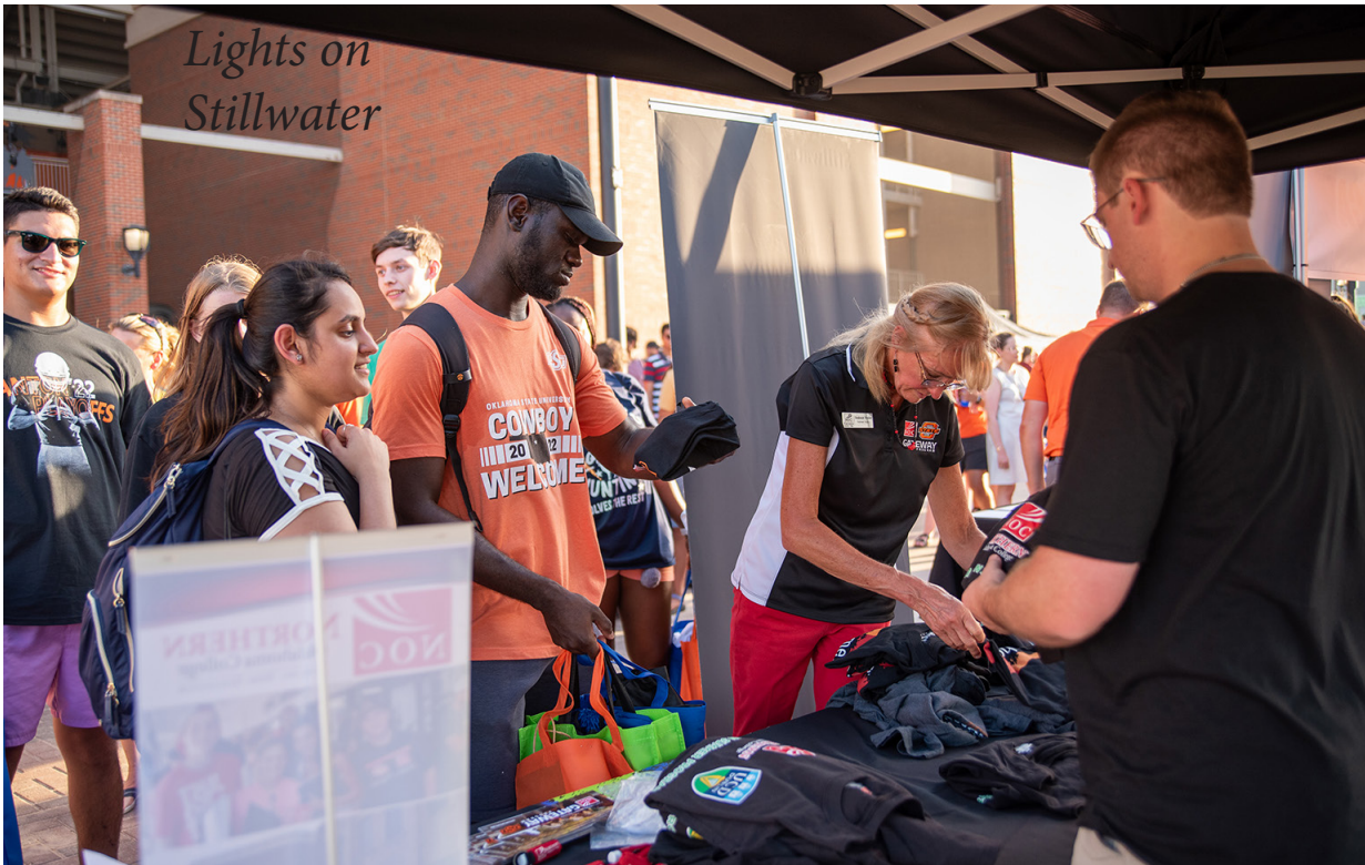
Lights on Stillwater