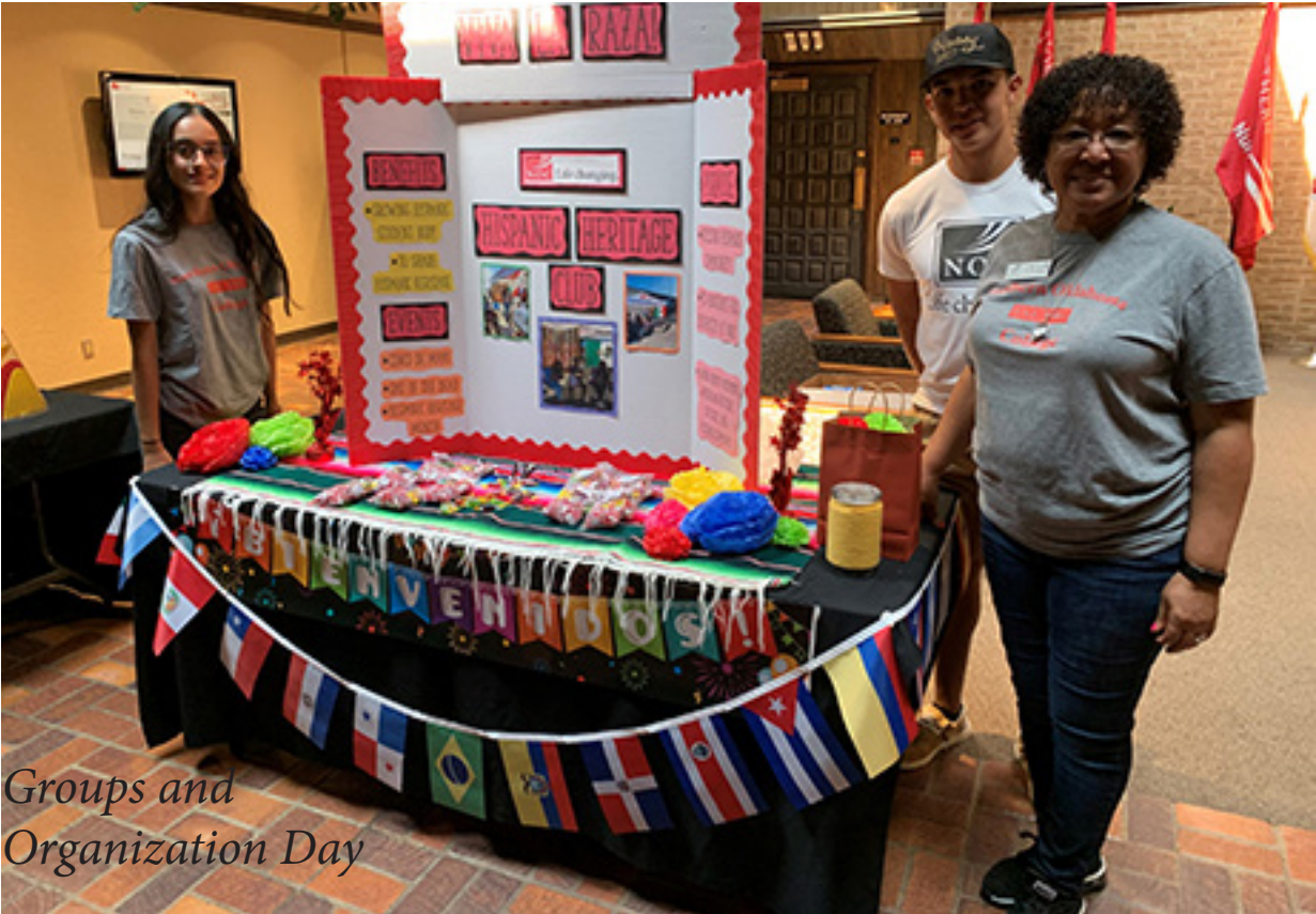
Groups and Organization Day