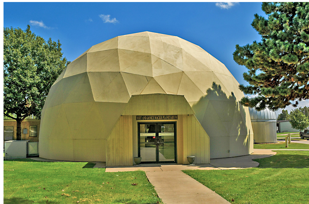
NOC Enid Mackie Planetarium