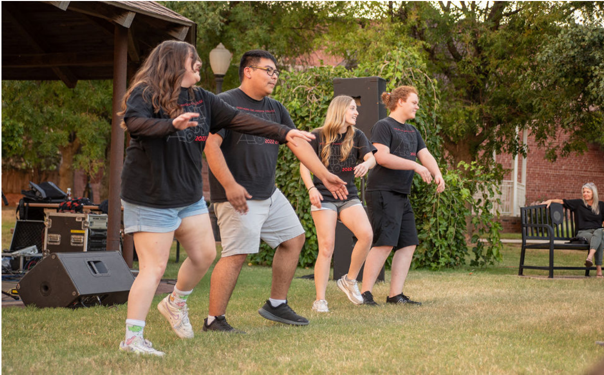
NOC Roustabouts and Roustabout Alums participated in a Full Moon Concert Thursday night in Tonkawa sponsored by the NOC Foundation and Alumni & Community Relations.