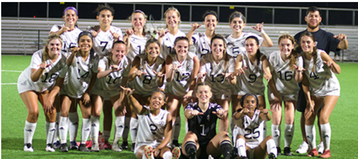
NOC Enid Women after 4-0 win over Redlands Sunday night in programs' first win