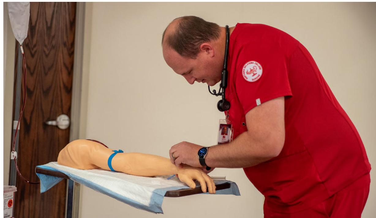
NOC nursing students participated in a Skills Lab Friday at the Renfro Center in Tonkawa.

Thirty-five students from all three NOC campuses participated in the 2nd annual professional workshop on the Tonkawa campus. The students came from nursing, pre-engineering and others providing networking opportunities. During breakout sessions students got the opportunity to talk with representatives from transfer institutions, industry representatives, and alumni. This workshop is designed to help develop critical work skills, resumes, and find internship opportunities.