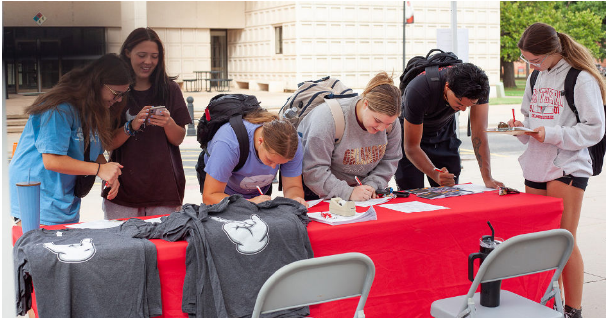
NOC students registered to vote last Friday as part of Constitution Day activities, sponsored by NOC Resident Life.