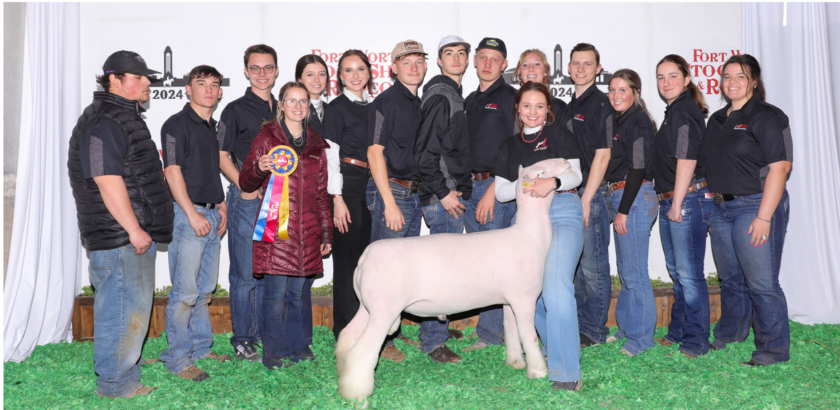
NOC Sheep Center with the Champion Ram at the Ft. Worth Show.