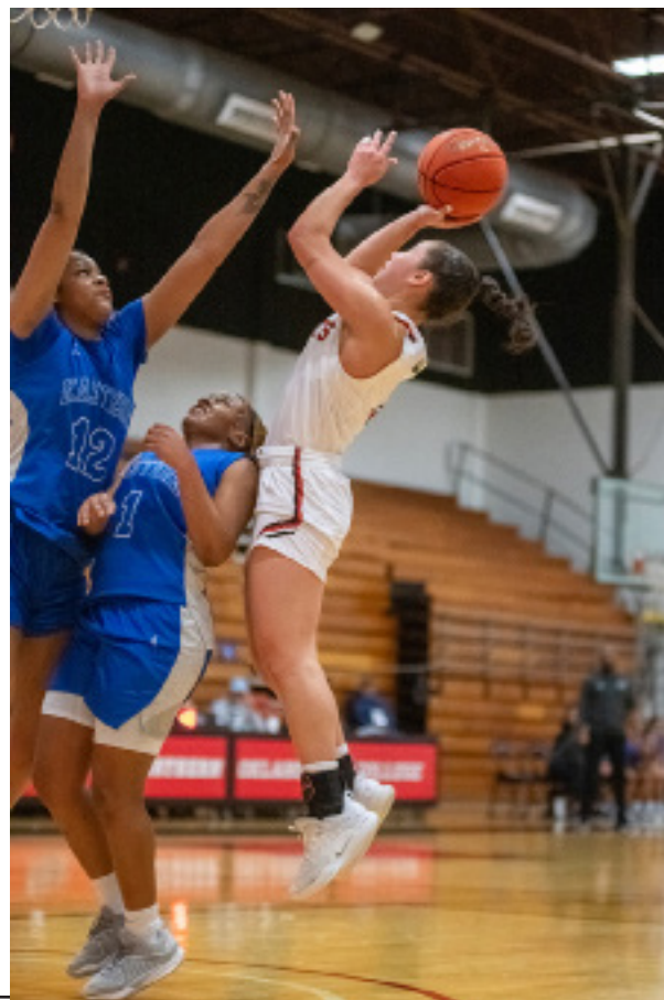
The NOC Enid Lady Jets (11-7) and Jets (9-15) travel to Western Thursday for conference games starting at 5:30 p.m. The Jets are at home Feb. 22 against Murray State.