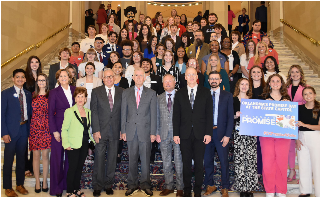
Oklahoma Promise Day at the Capitol on Thursday, April 11.