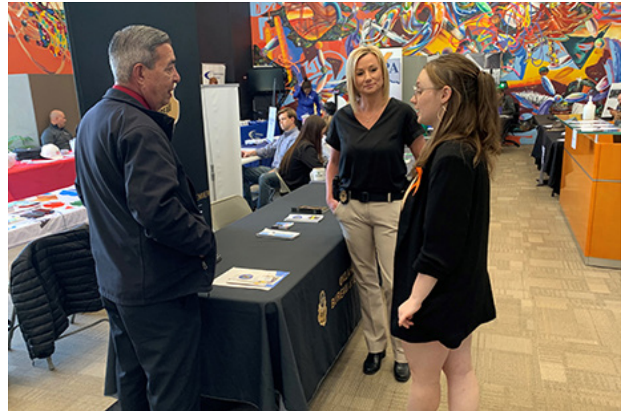
NOC Tonkawa students attended a Career Day on Wednesday at the Cultural Engagement Center. Enid students will attend a Career Day on April 17 in the Gantz Center.