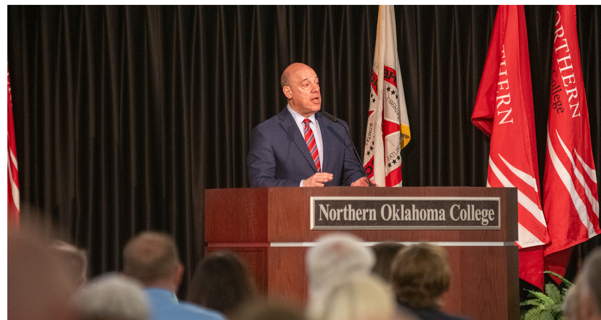
Ari Fleischer spoke to a full house at the Renfro Center in Tonkawa Tuesday night at the Renfro Endowed Lectureship Series.