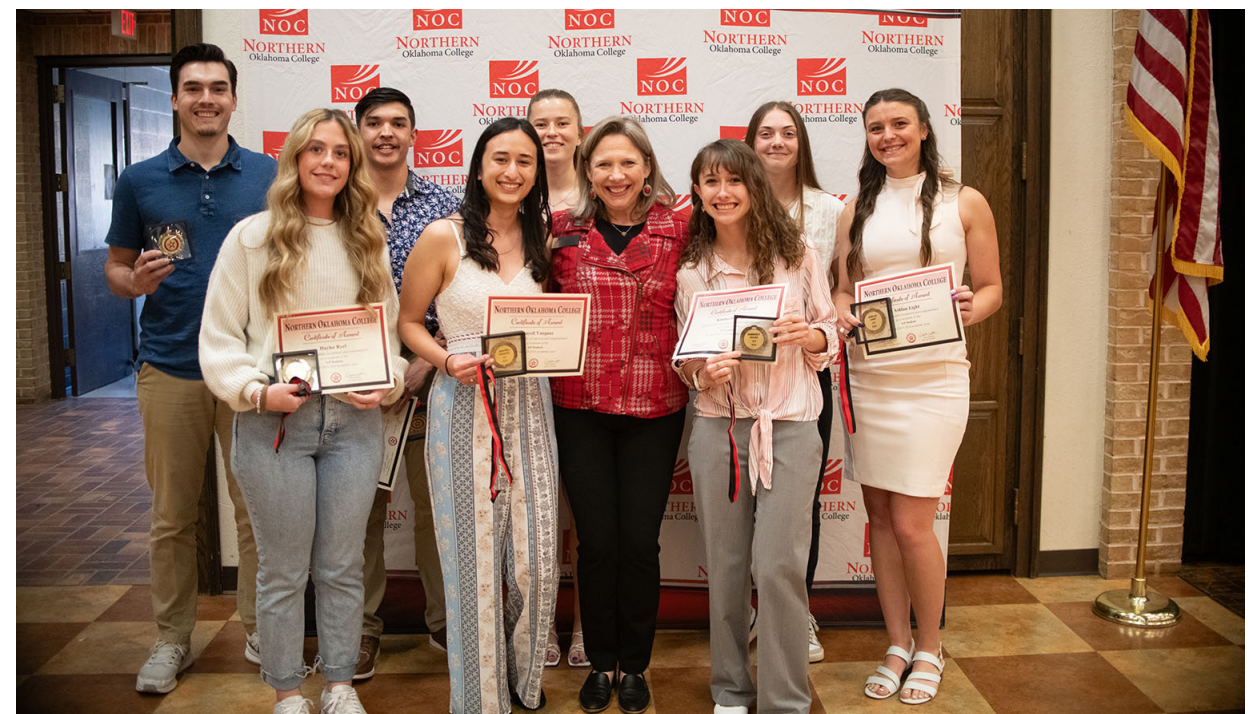
NOC Enid 4.0 Students