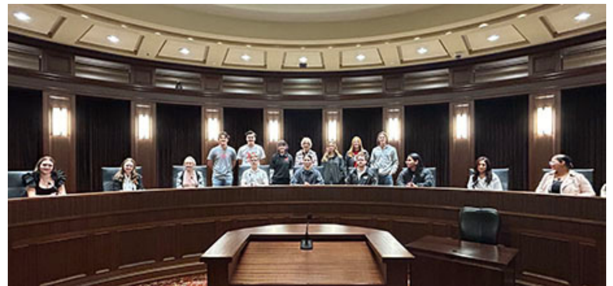
NOC Enid PLC Students and Enid/Tonkawa Criminal Justice Students met with Oklahoma Supreme Court Justice Noma Gurich at the Oklahoma Supreme Court on a trip to Oklahoma City April 11.