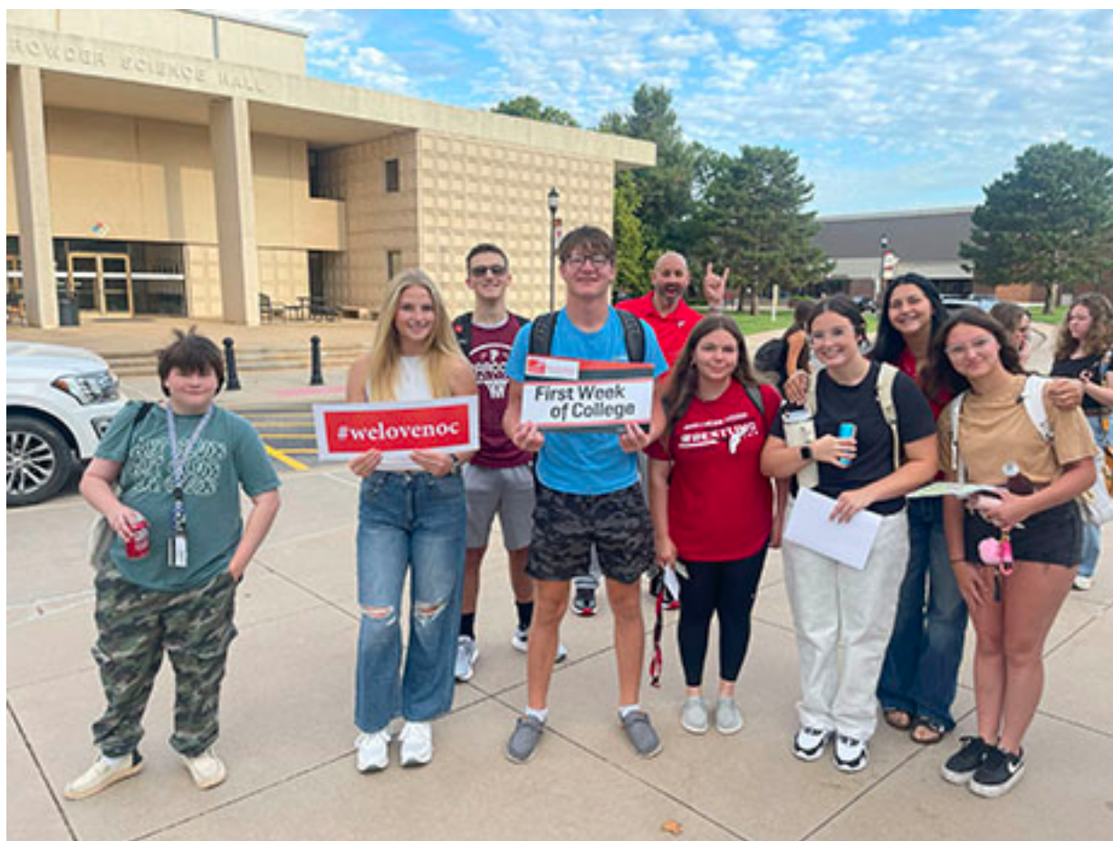
NOC Tonkawa students attend classes on Monday.