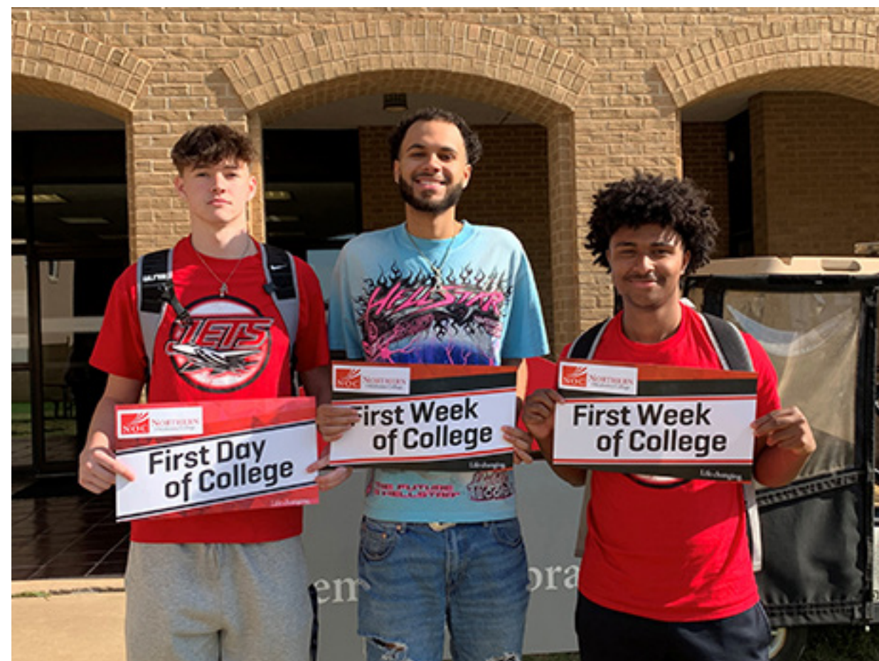
NOC Enid students pose for photos at Zollars Library.