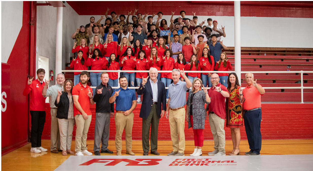
First National Bank of Oklahoma donated two new mats for the NOC wrestling programs. Bank officers and NOC administration are pictured with members of the men's and women's wrestling programs.