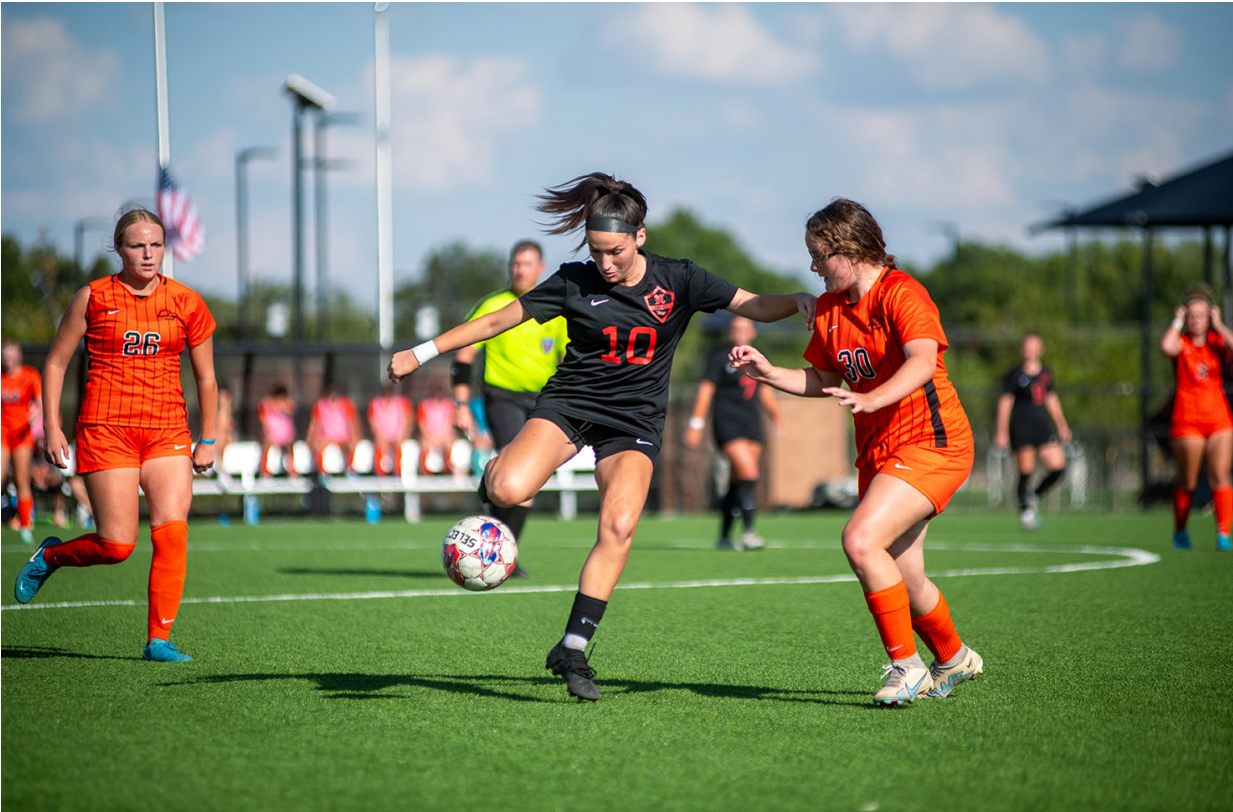
Jets Women's Soccer is 2-1-2 on the season, their next home game is Wednesday, Sept. 18 against Rich Mountain (AR) at 5 p.m.