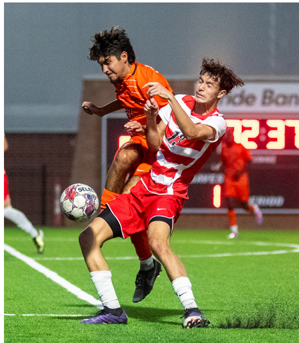
Jets Soccer is 3-3 on the season, the Jets host Rich Mountain (AR) on Wednesday, Sept. 18 in their next home game.