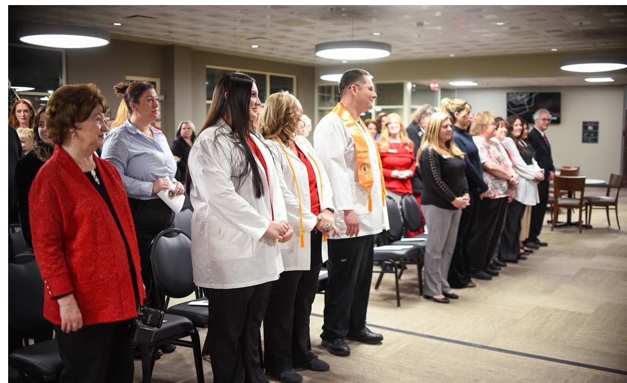
NOC Nursing graduates and faculty at the NOC Nurses Pinning Ceremony December 6 at NOC Stillwater. (photo by Shiloh Martin/Northern Oklahoma College).