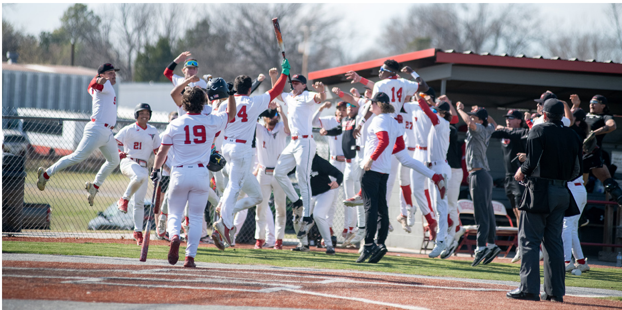
Mavs' Baseball celebrates a win in 2024