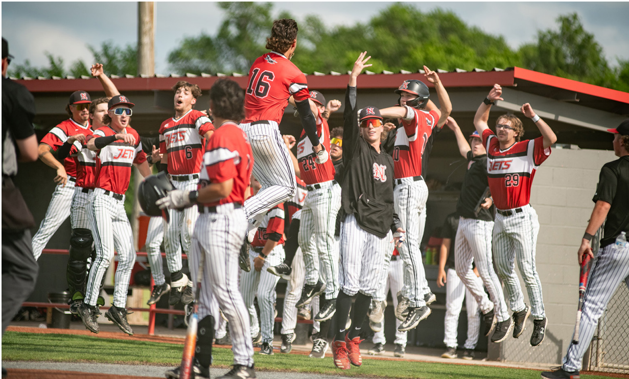
Jets Baseball celebrates a win in 2024