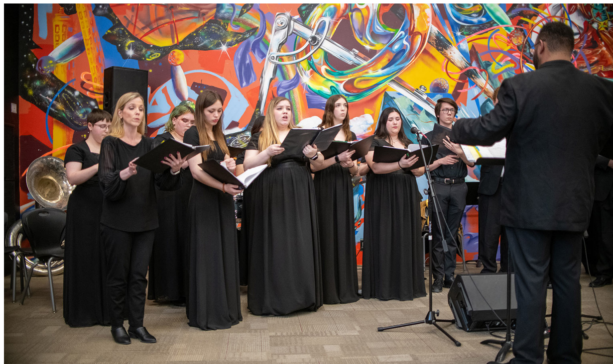
NOC Fine Arts students performed at a Black History Month Celebration Concert at the Cultural Engagement Center at NOC Tonkawa on Monday.