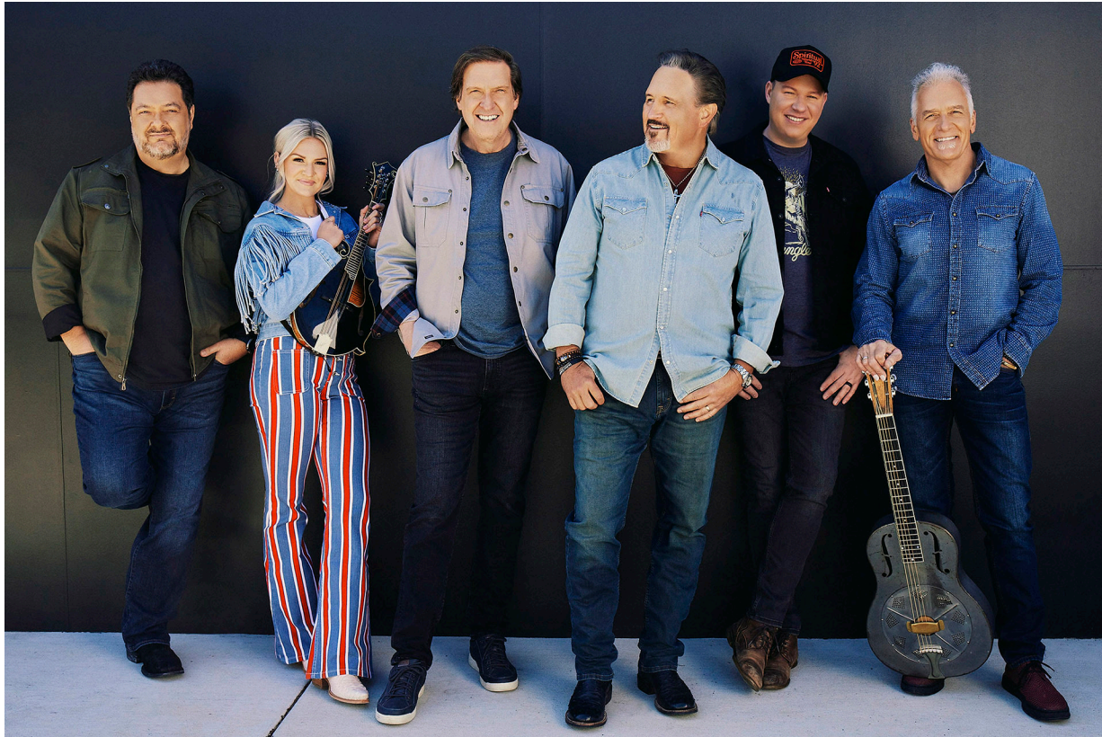
Diamond Rio will be performing at Northern Oklahoma College for the spring Renfro Lectureship Series on April 3. Tickets go on sale March 11.