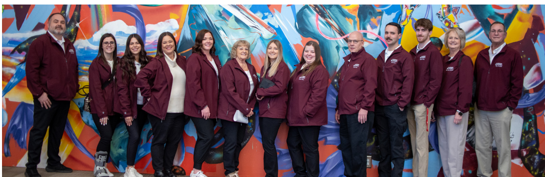
2025 BLACKWELL LEADERSHIP CLASS