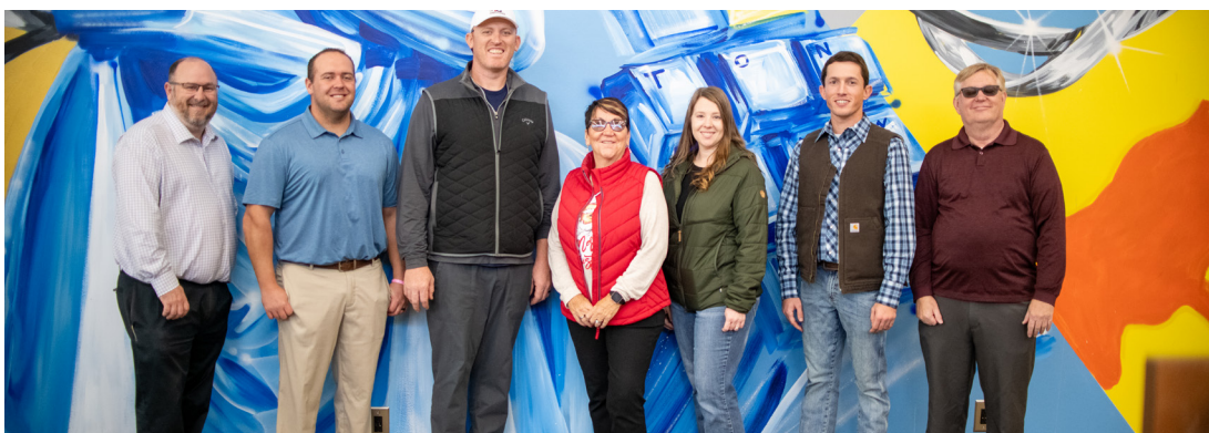
2025 TONKAWA LEADERSHIP CLASS

Several community groups joined us on our campuses earlier in the year to learn about our various programs at Northern Oklahoma College.