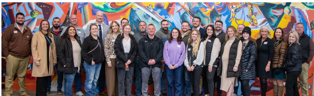
2025 PONCA CITY LEADERSHIP CLASS