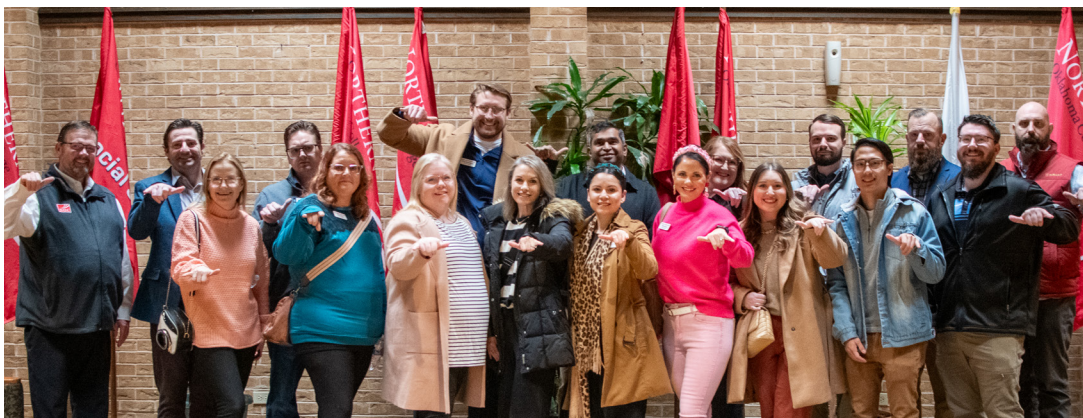
2025 ENID LEADERSHIP CLASS