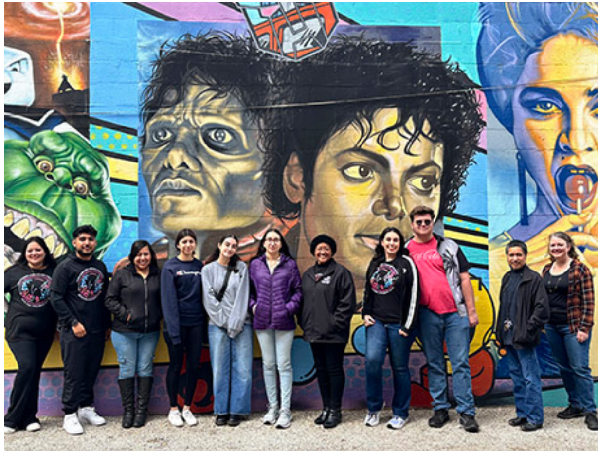
Members of the NOC Enid Hispanic Club, Viva la Raza!, toured the Enid Art Murals on April 4. (photo provided)