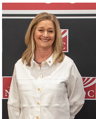
NOC 30-Year Service Award