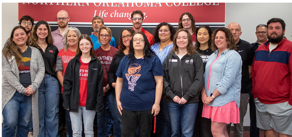
NOC 1-Year Service Awards

Northern Oklahoma College faculty and staff received service pins Friday, May 9, at the In-Service at the Renfro Center in Tonkawa. Outstanding Faculty, Professional Staff, and Support Staff were honored and six retirees were recognized.