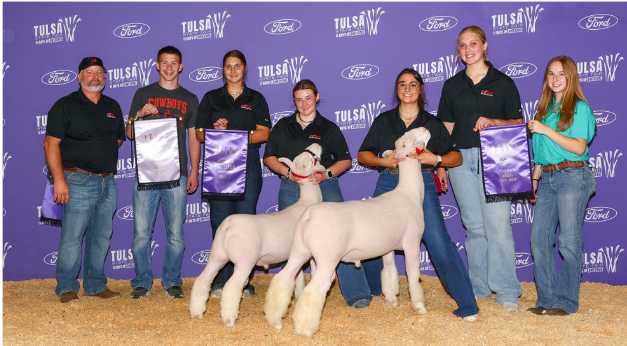
Four NOC students showed sheep at the Tulsa State Fair last weekend. The students were named Premier Exhibitors at the show.