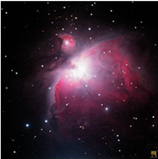
Photo Credit: NOC maintains a license with Slooh to capture images with the Slooh Telescopes. This photograph of the Orion Nebula (M42) was taken through the Slooh Telescopes by Dr. Frankie Wood-Black on January 10, 2026 through the Chile Two Telescope.

night sky and moving away from sources of light pollution. For best viewing, allow yourself some time to adjust to the darkness; the stars will start providing the light for viewing. Avoid looking at your phone or other light sources for at least 15 minutes before trying to locate those faint objects. You can use a red-flash light or your phone's "night mode" to help.