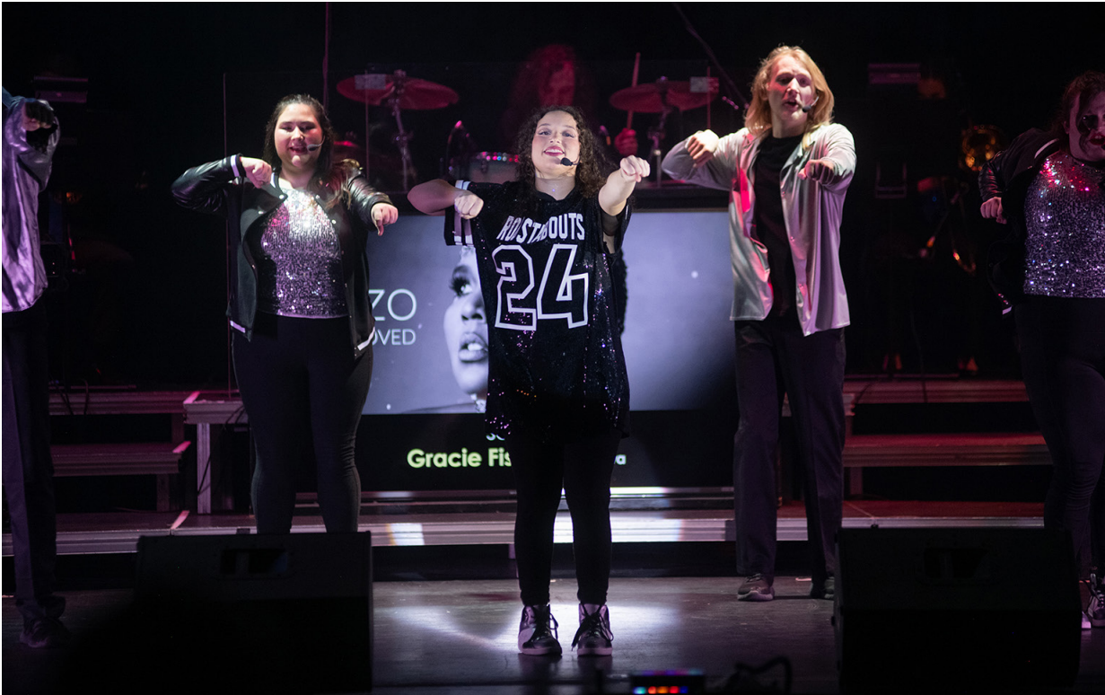
The Northern Oklahoma College Roustabouts will host their annual Homecoming Show Thursday, Jan. 29, in Tonkawa. The performance, set to start at 7:30 p.m. inside the Kinzer Performing Arts Center, is free of charge but students under 12 should be accompanied by an adult.