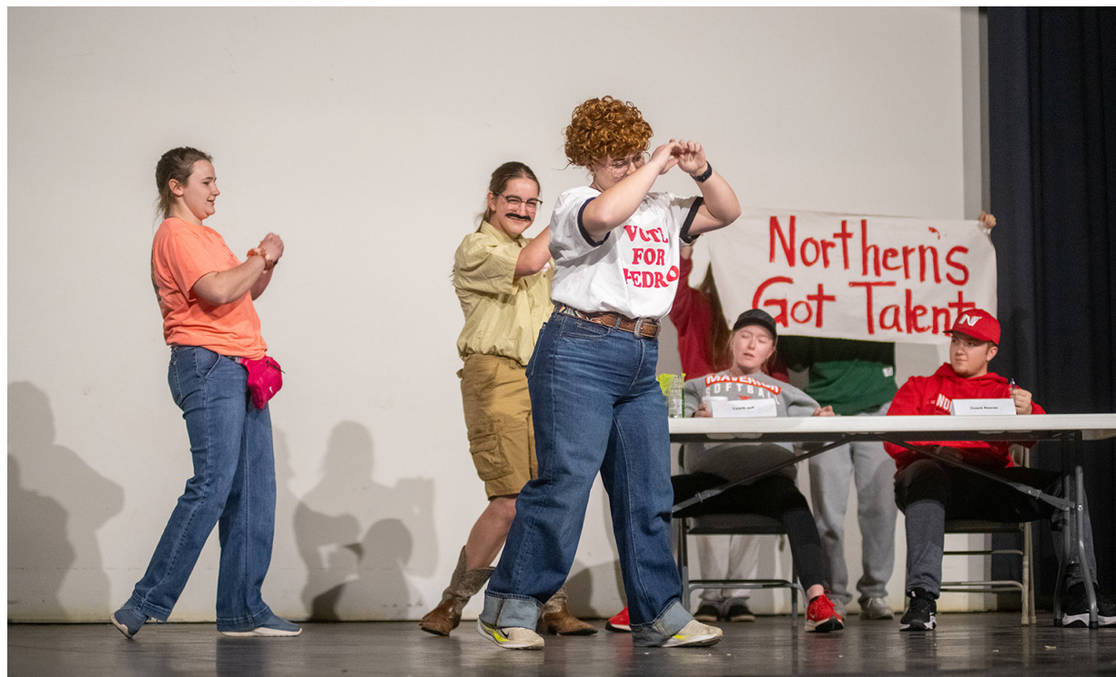
The NOC Tonkawa BCM performs a skit at the 2025 “That’s No Bull Review.”

Admission is free but food donations of non-perishable food is accepted.