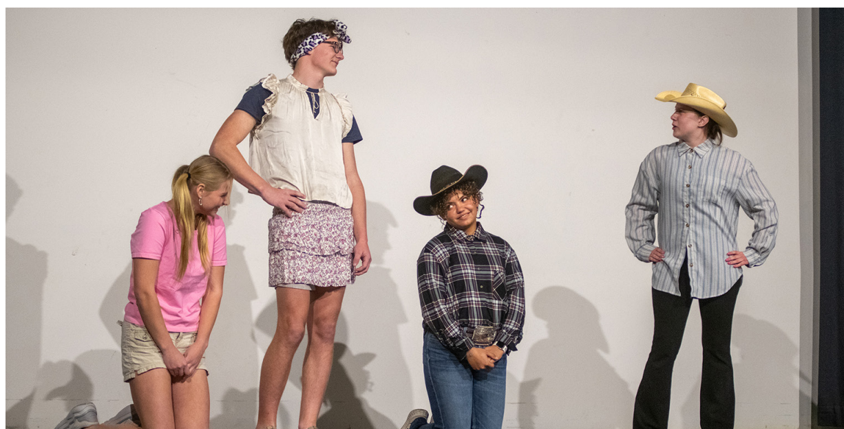
NOC Tonkawa students will perform Homcoming skits at the "That's No Bull Review" during Homecoming Week. This year's review is set for Tuesday.

These events are all weather permitting. Please watch your email for event updates.