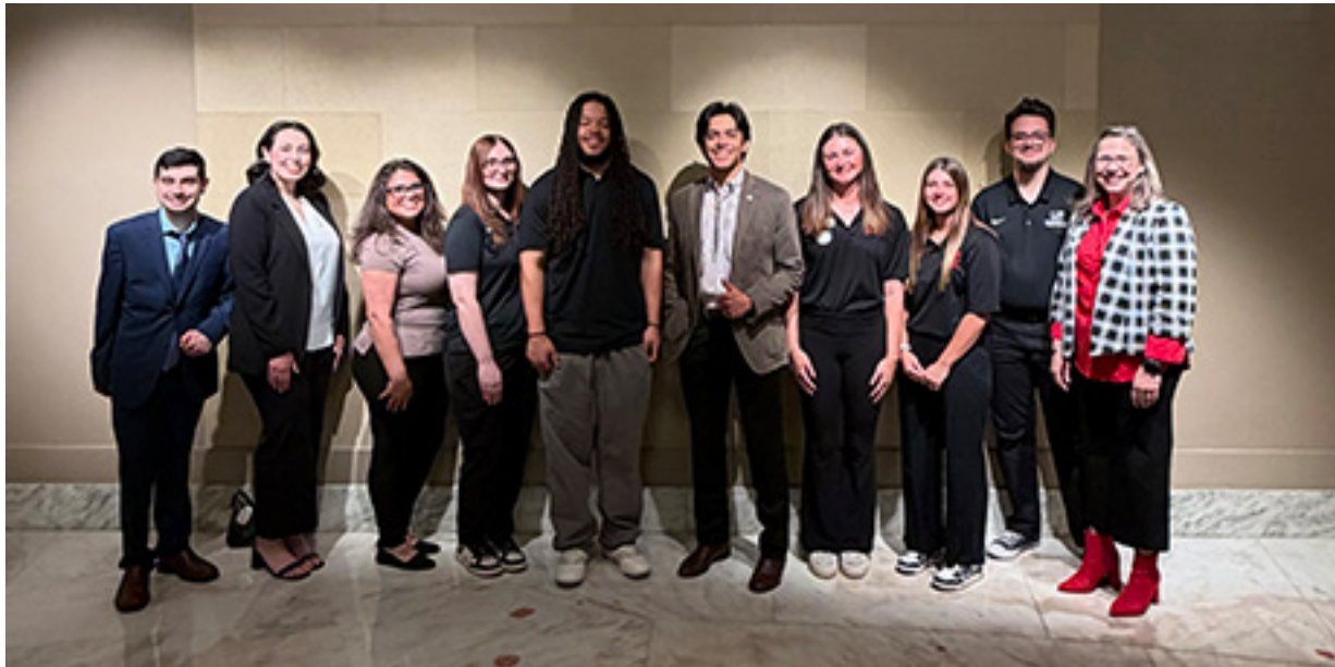
NOC students, faculty, and staff attended the annual Higher Ed/Oklahoma Promise Day at the Oklahoma State Capitol this past week.